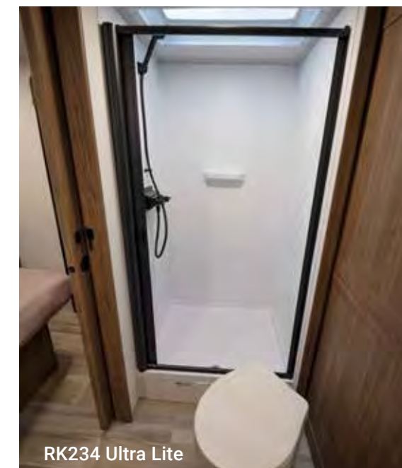
RK234 Ultra Lite