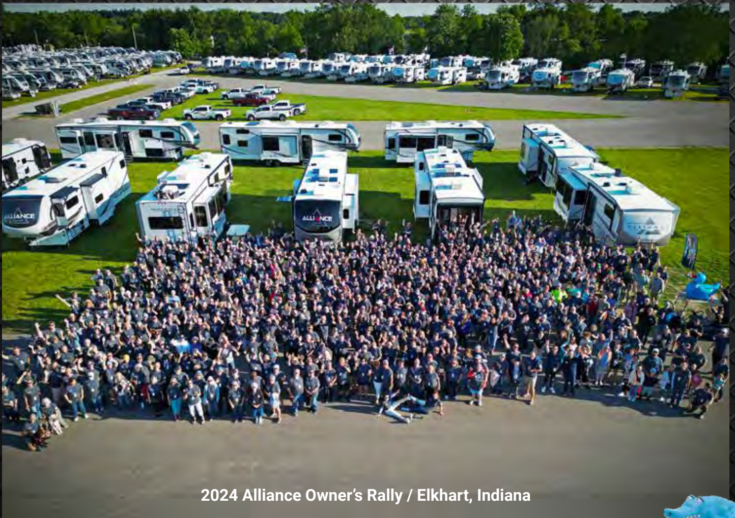
2024 Alliance Owner's Rally / Elkhart, Indiana