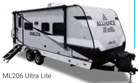
ML206 Ultra Lite