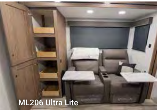
ML206 Ultra Lite