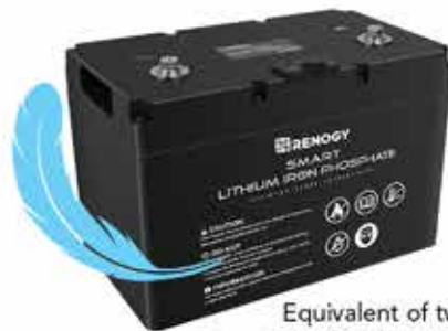
Equivalent of two traditional RV batteries and 1/5 the weight!

In addition to more 12 volt systems than similar Haulers on the market