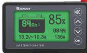
Know exactly what is really going on with real time monitoring of power usage and battery condition.