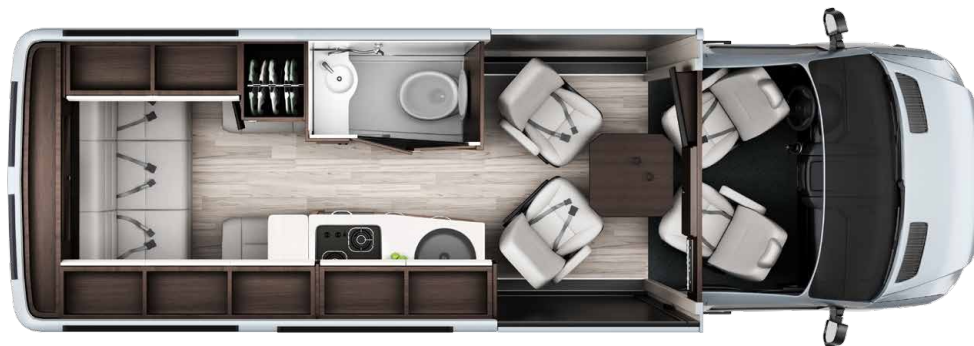
FS22TE Free Spirit TE