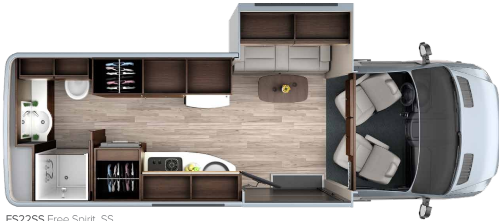
FS22SS Free Spirit SS