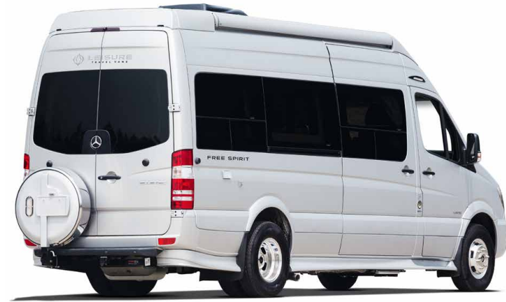
Shown with Optional Roof Trim Kit with Integrated Awning