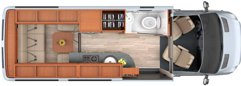
FS22 Free Spirit