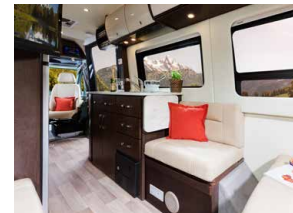
Espresso Brown 50th Anniversary Décor Package