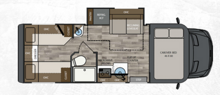
25TBC | 25' TWIN BEDS W/ CABOVER BUNK