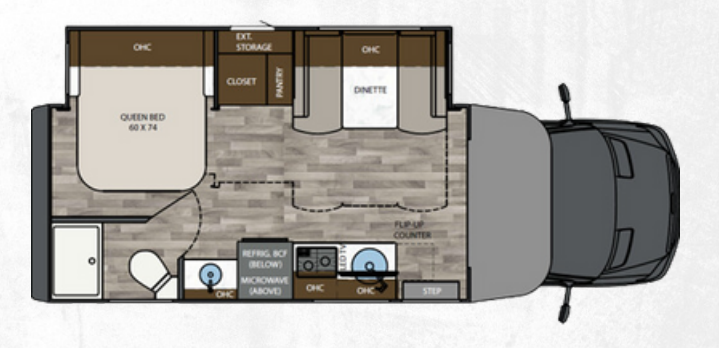
25FWS | 25' FULL WALL SLIDE W/ CABOVER STORAGE