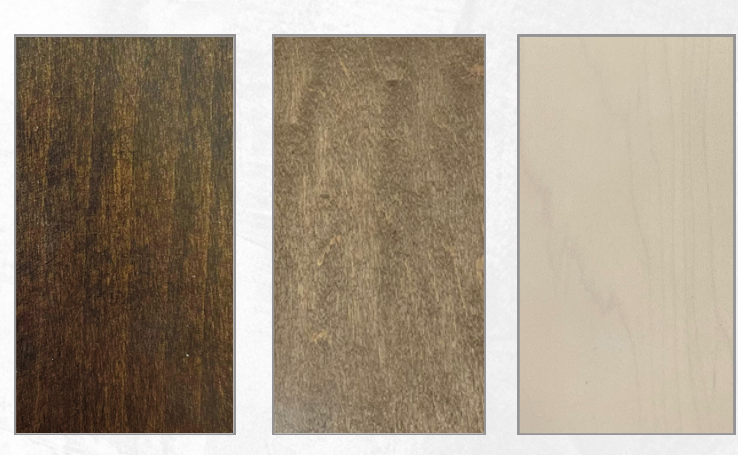
BURNISHED LAKEWOOD CASHMERE SABLE