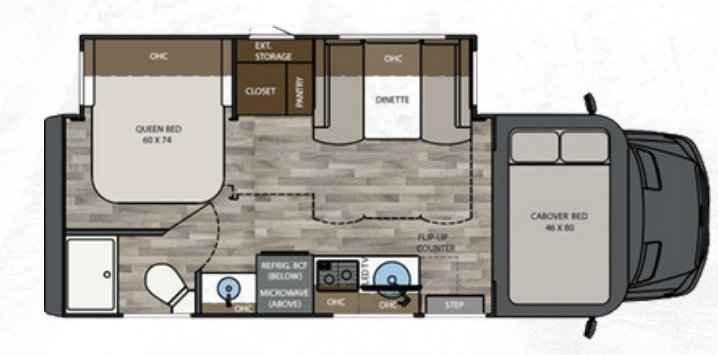
25FWC | 25' FULL WALL SLIDE W/ CABOVER BUNK