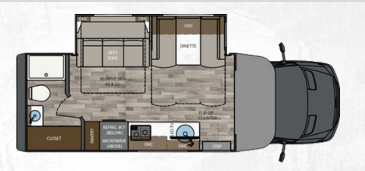
25RML | 25' MURPHY BED W/ CABOVER STORAGE