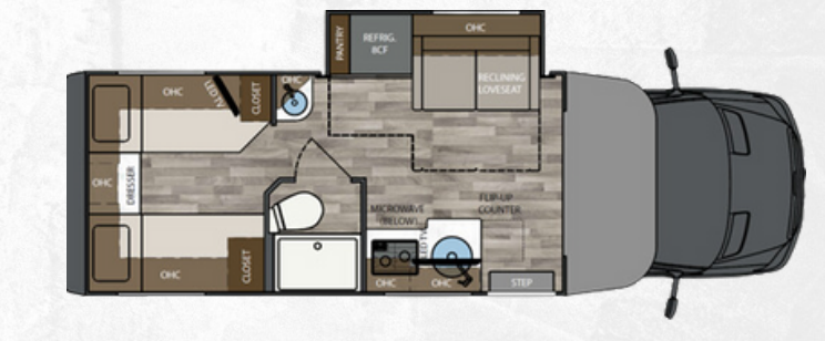
25TBN | 25' TWIN BEDS W/ CABOVER STORAGE