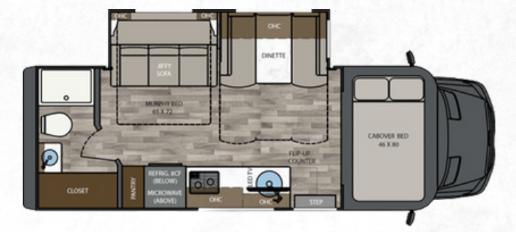
25RMC | 25' MURPHY BED W/ CABOVER BUNK