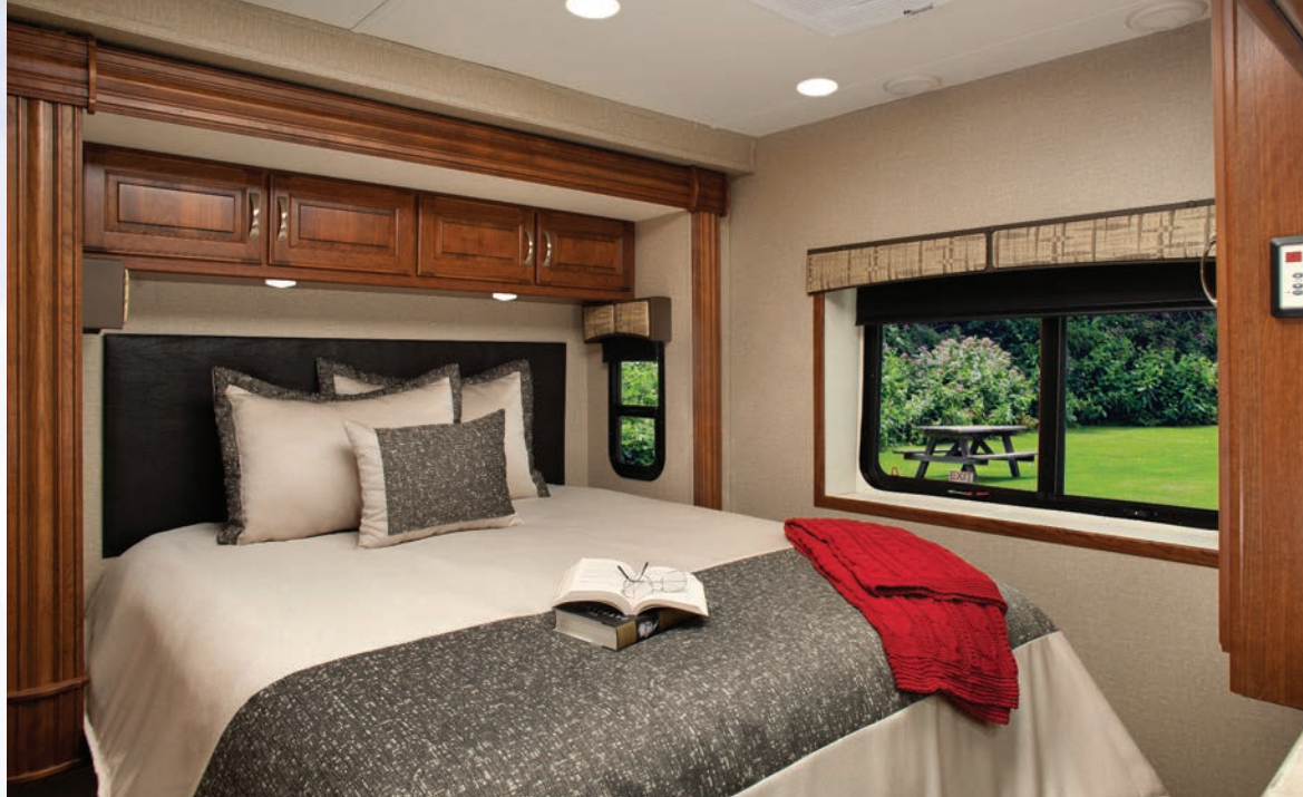
The Isata 36DS master bedroom is furnished with a comfortable king sized iCool™ mattress. In addition, USB and 110V outlets on both sides of the bed provide convenient charging for all your devices.