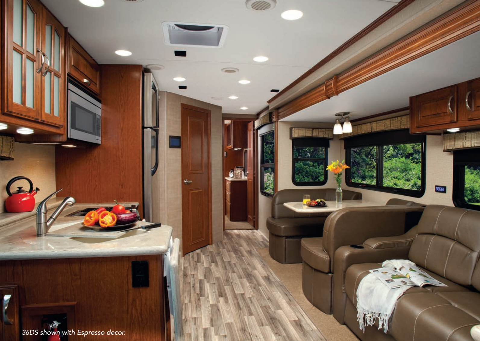
36DS shown with Espresso decor.