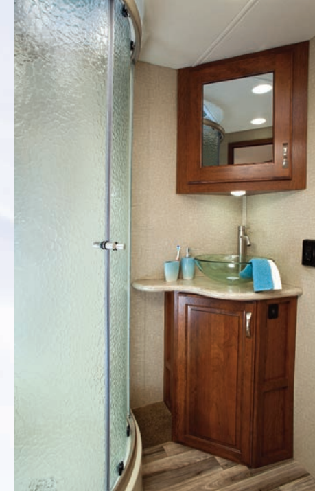
The contemporary, vessel bowl sink maximizes usable counter space.