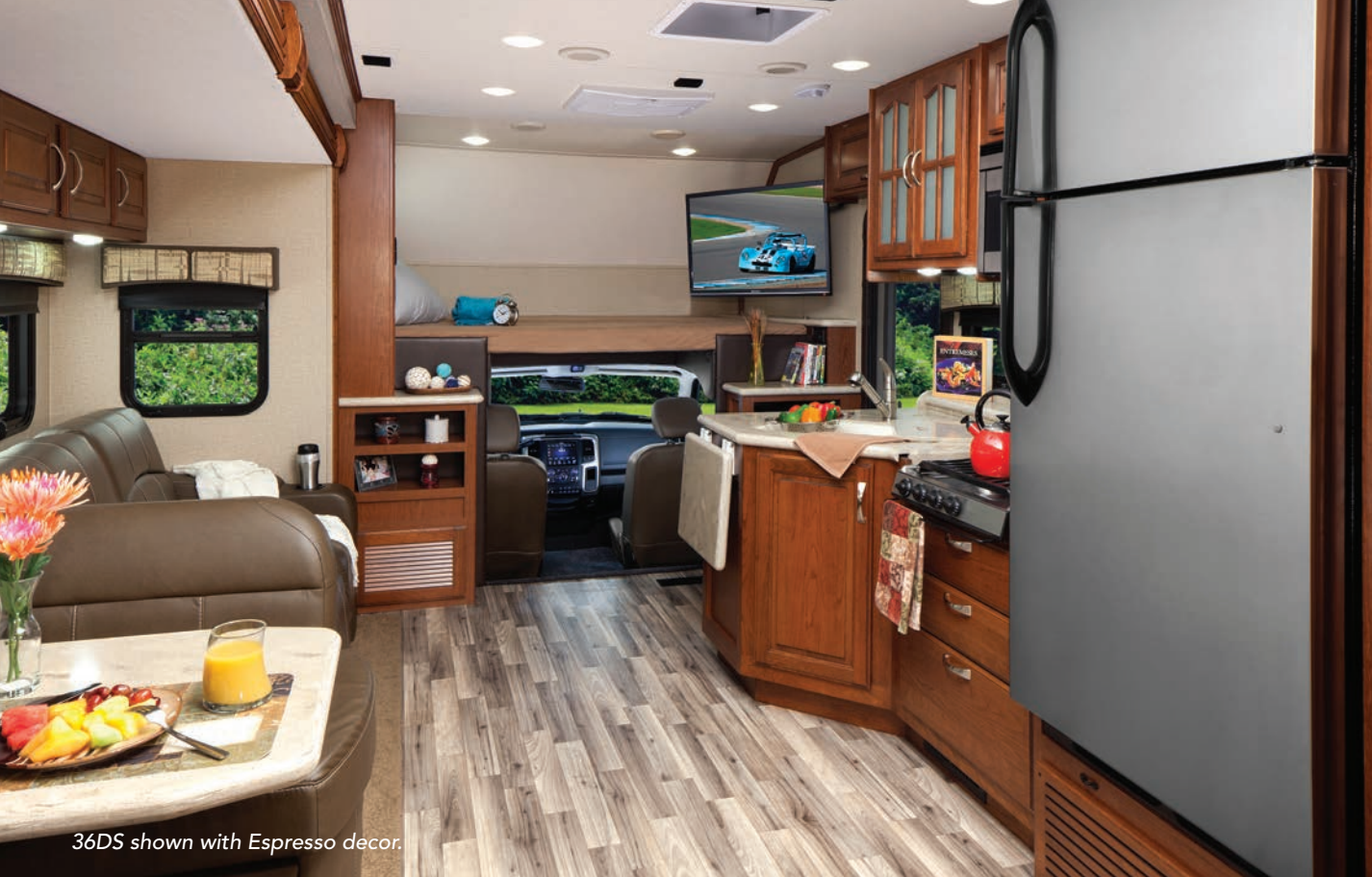
36DS shown with Espresso decor.