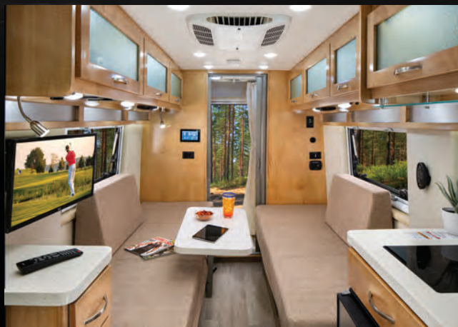
The versatile 20RB twin bed model has contemporary hardwood cabinetry and a spacious rear bath with a one-piece fiberglass shower. Nova's side windows open to increase ventilation.