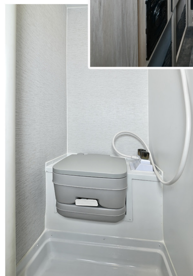
Atom 600 interior includes a porta-potty/shower