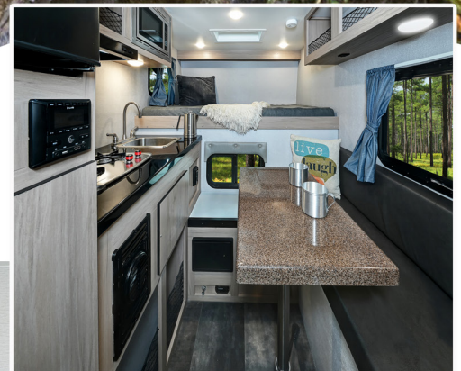
Atom 400 interior