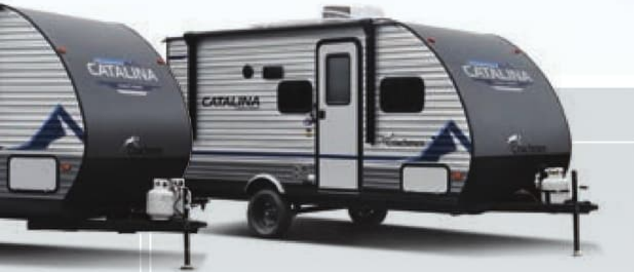
Summit Series 7

Today, Coachmen is stronger than ever as part of Forest River, Inc. So you can have confidence that we will be around to make your ownership worry free for a long time to come. For nearly 60 years, we have built a nationwide network of loyal dealers and service centers who are committed to keeping your RV lifestyle trouble free. No matter where the open road takes you, you are never far from Coachmen's customer service and support.