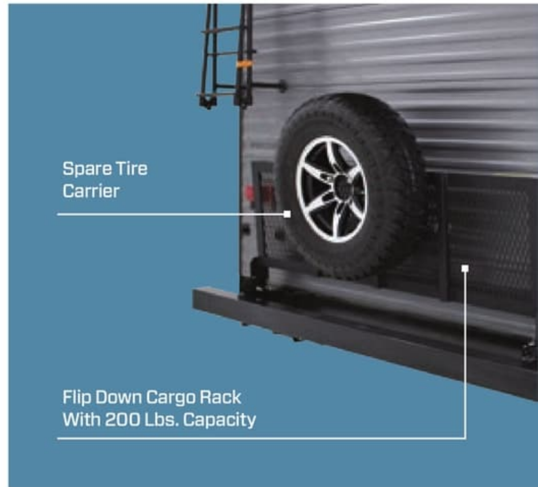
Spare Tire Carrier