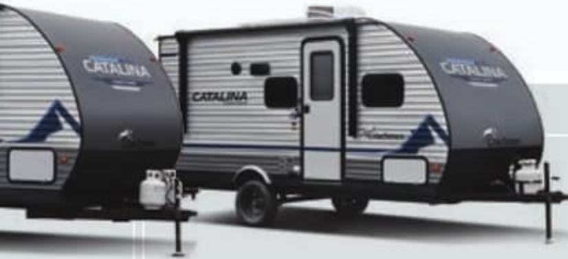
Summit Series 7

Today, Coachmen is stronger than ever as part of Forest River, Inc. So you can have confidence that we will be around to make your ownership worry free for a long time to come. For nearly 60 years, we have built a nationwide network of loyal dealers and service centers who are committed to keeping your RV lifestyle trouble free. No matter where the open road takes you, you are never far from Coachmen's customer service and support.