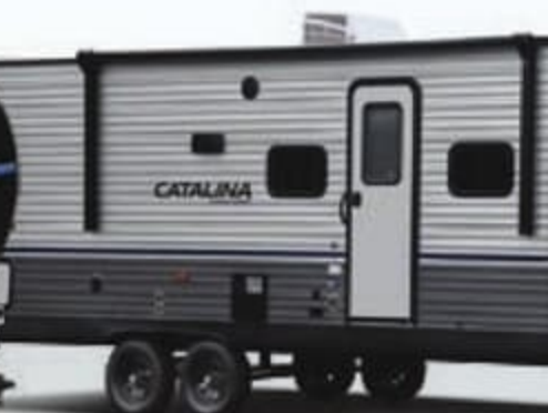
Summit Series 8