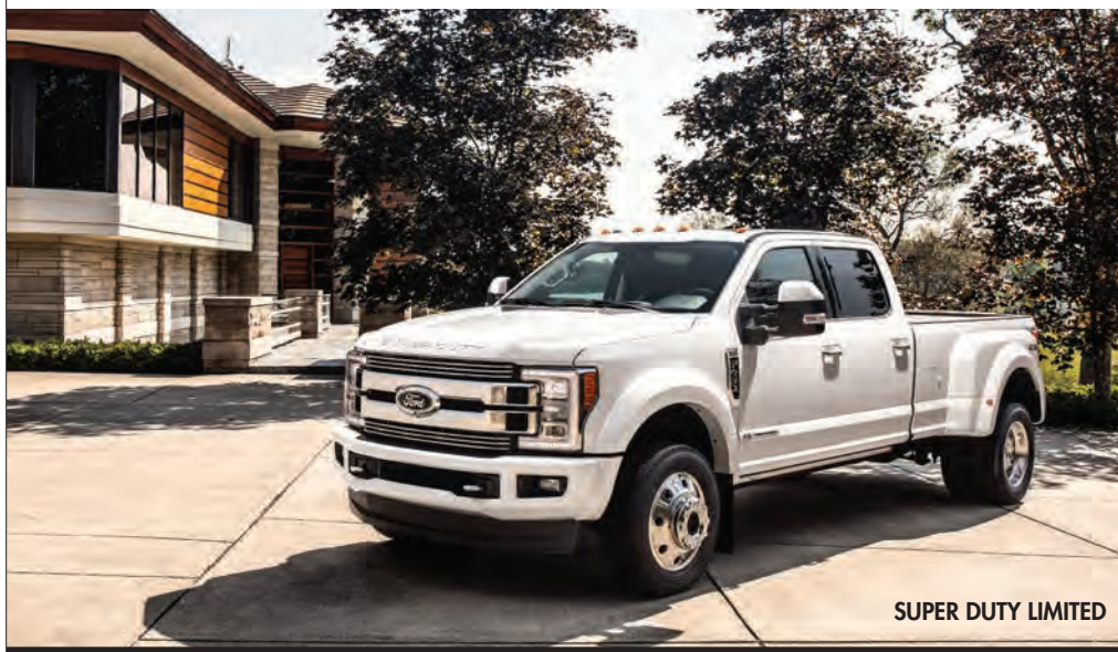
SUPER DUTY LIMITED

Not everyone who needs a truck will use it to haul rocks, dirt, hay and utility trailers. Some will haul gold-plated yachts and diamond-encrusted Rolls Royces (we jest, of course). For these customers — ahem , clients — Ford presents its Super Duty Limited Series and invites the well-heeled to shell out up to $94,455 for