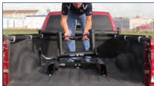
Slide the shock towers into the base.