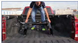
Attach the base.

Lightweight, modular design enables one person installation and removal.