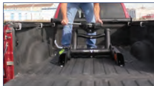
Attach the hitch head.

5,000 lb Vertical Tongue Weight • 20,000 lb Gross Trailer Weight 3 vertical adjustments: 17", 18", and 19"