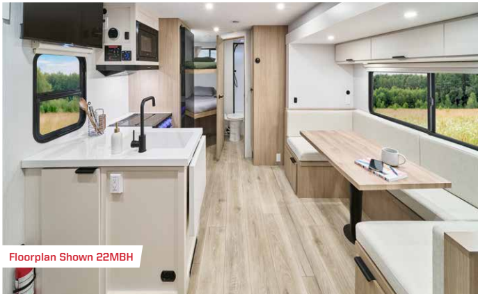
Floorplan Shown 22MBH