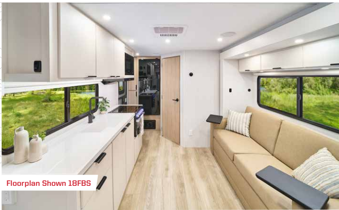
Floorplan Shown 18FBS