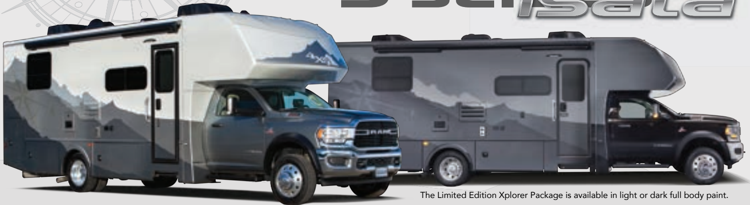
The Limited Edition Xplorer Package is available in light or dark full body paint.