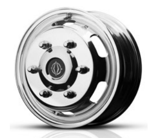
Optional Alcoa Dura-Bright® Aluminum Wheels All 6 Aluminum Wheels, 4 Dura-Bright® Wheels