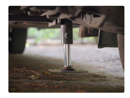
4-Point Self-Leveling Jacks