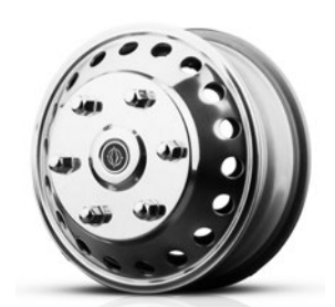
Standard Steel Wheels With Wheel Simulators