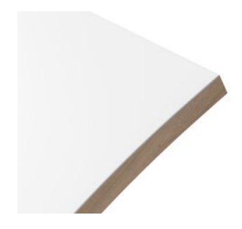
Bianco White FENIX NTM®