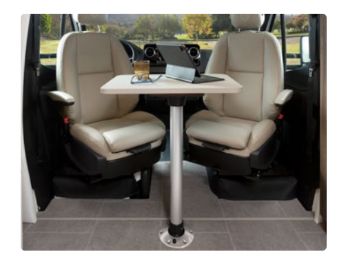
Removable Front Table between Captain Chairs (Murphy Bed, FX, Corner Bed)