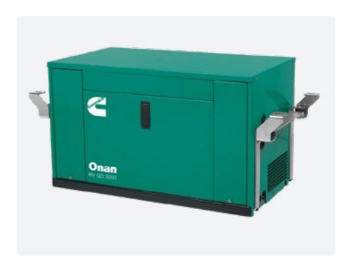
3.2 kW Diesel Generator With Auto Start and Auto Changeover Switch