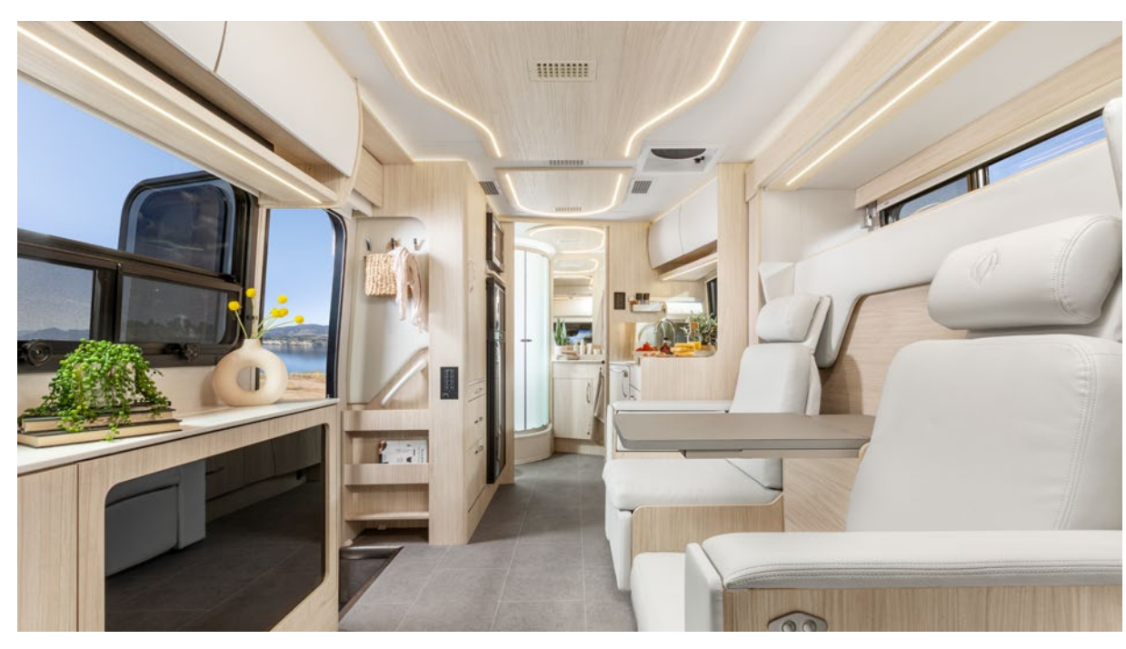
White Oak shown with Cabinetry Upgrade