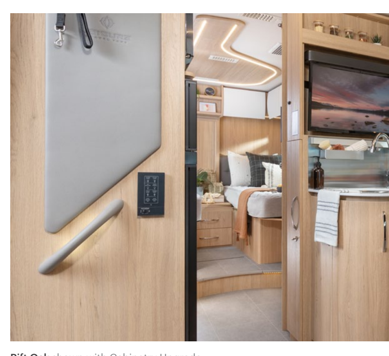
Rift Oak shown with Cabinetry Upgrade