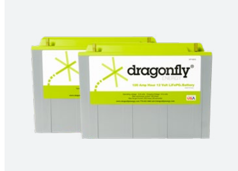
Dual 100 A·h, 12 V Lithium Coach Batteries With Built-in Heating Function