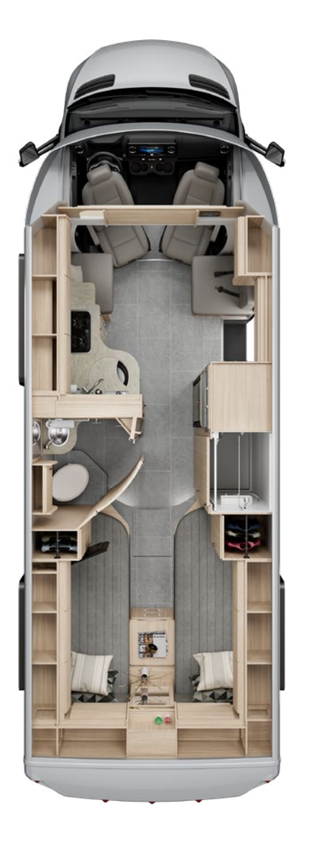
Corner Bed | U24CB (Shown with Standard Dinette)