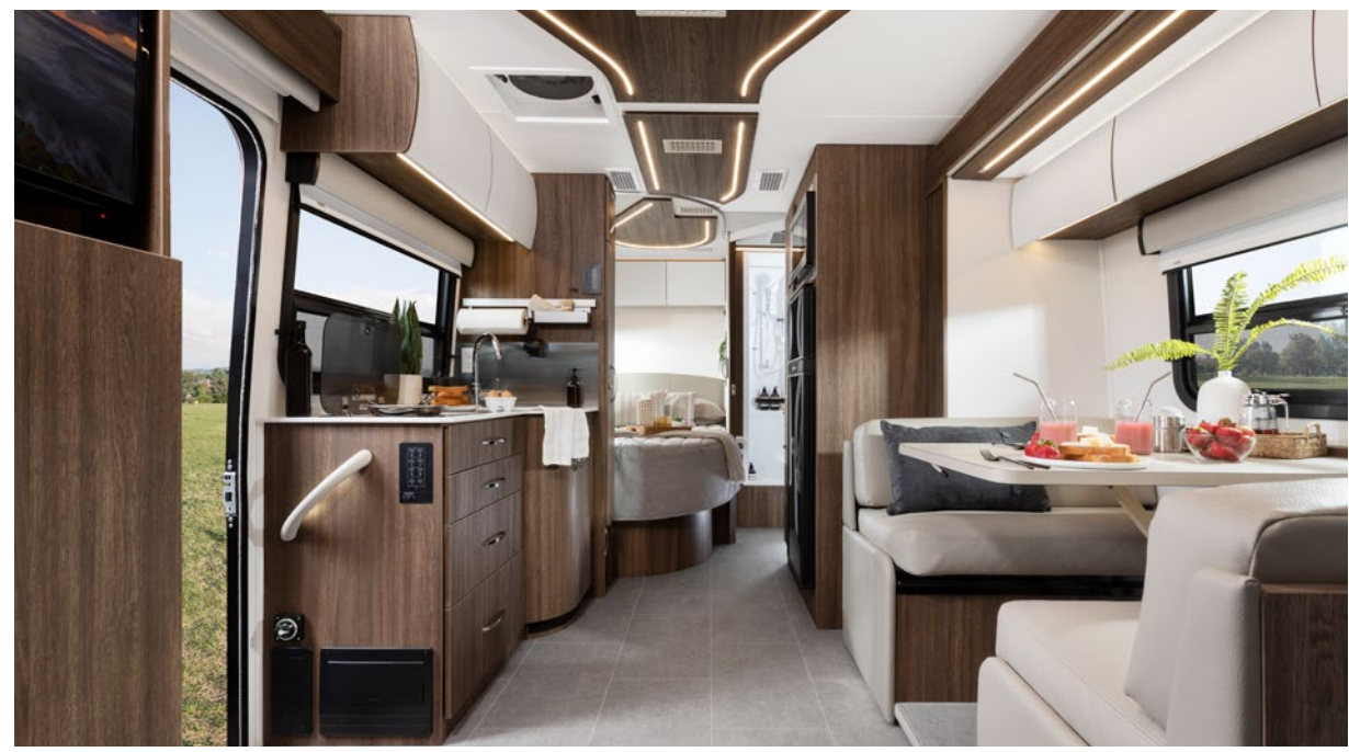
Mocha shown with Cabinetry Upgrade