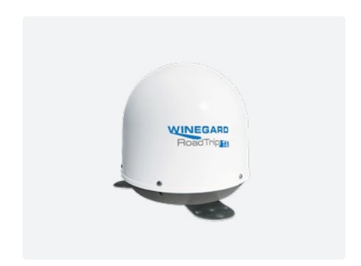
Auto-Acquisition Satellite Dish