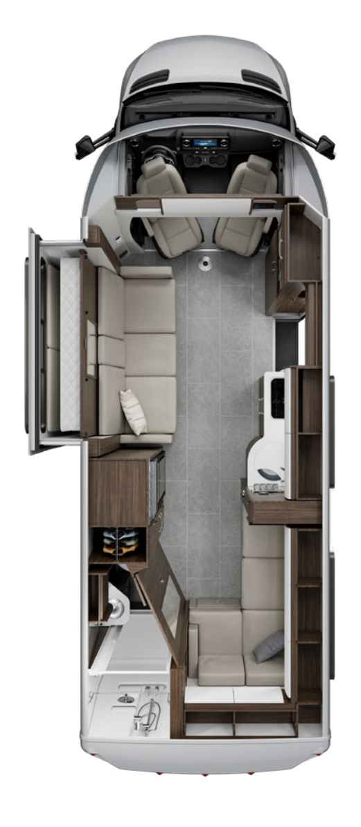
Murphy Bed Lounge | U24MBL