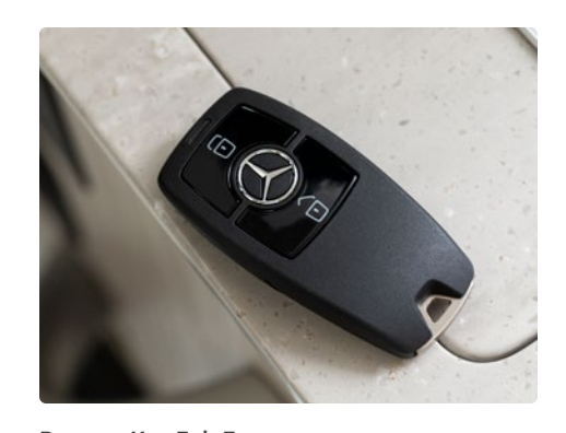
Remote Key Fob Entry Coach Entrance Door