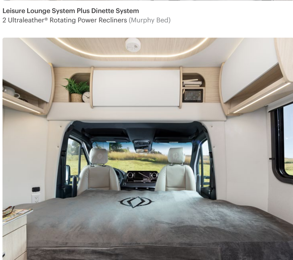
Inflatable Bed for Front Dinette 45" × 88" Sleeping Area (Rear Lounge, Twin Bed)