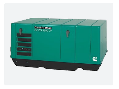
3.6 kW LP Generator With Auto Start and Auto Changeover Switch