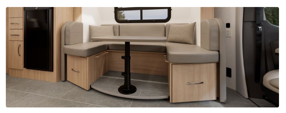
U-Lounge Dinette with Easy Lift Table Ultraleather* 40" × 69" Sleeping Area (Corner Bed)