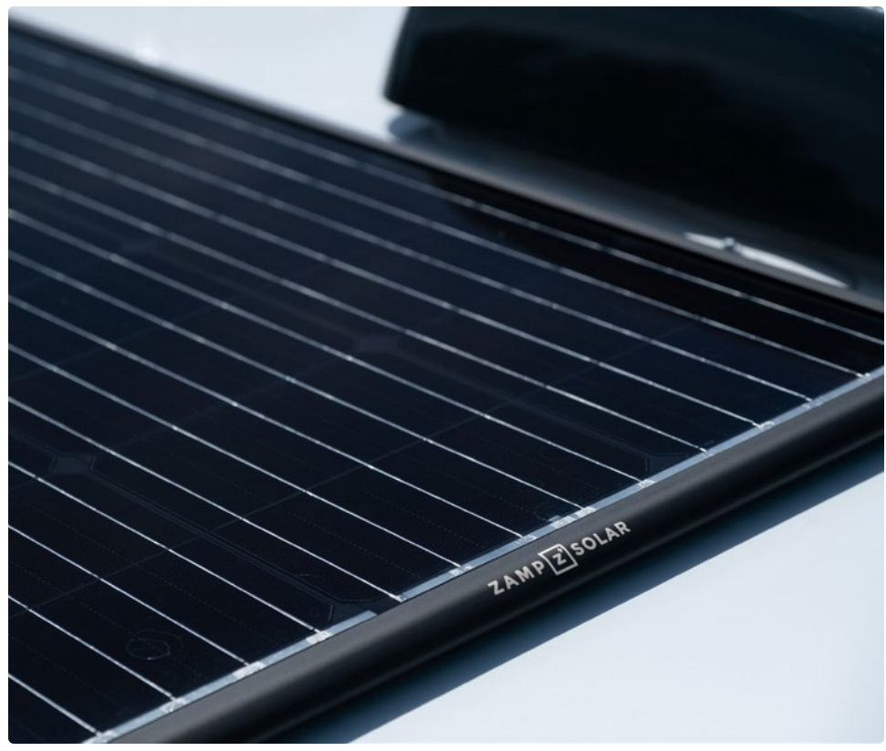
Rigid Solar Panels with Control Panel 200 W or 400 W