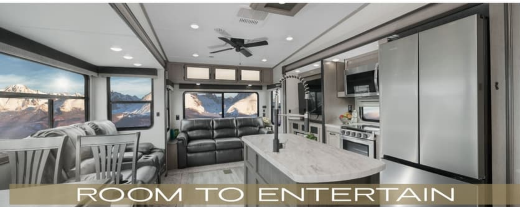
ROOM TO ENTERTAIN