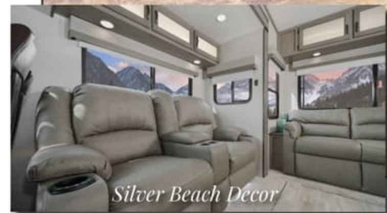
Silver Beach Decor