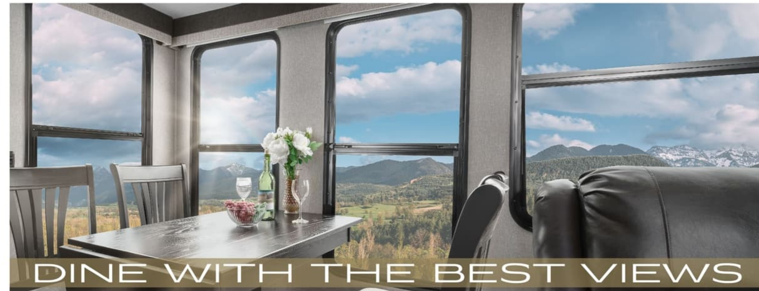
DINE WITH THE BEST VIEWS