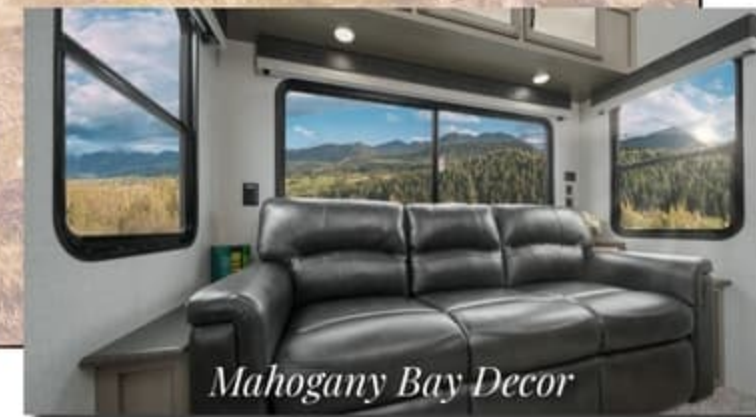
Mahogany Bay Decor