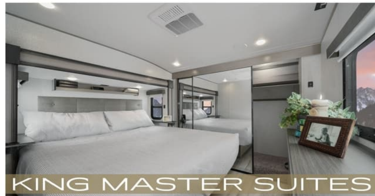
KING MASTER SUITES