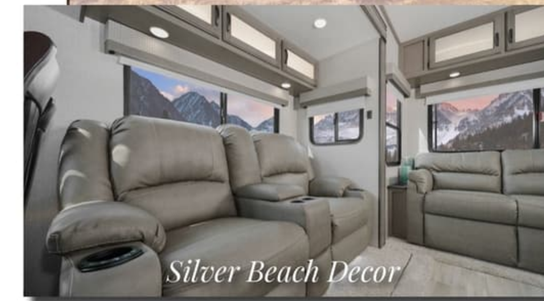
Silver Beach Decor