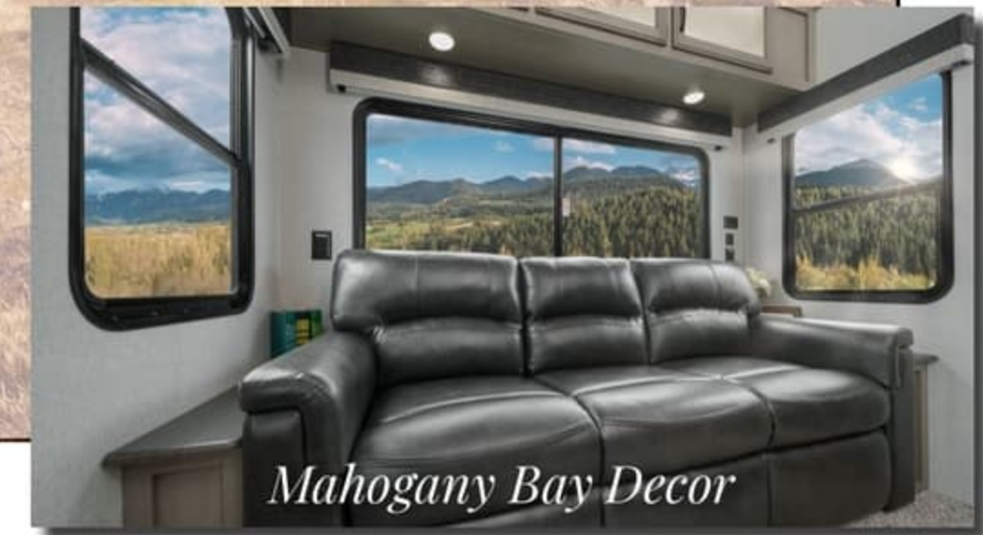
Mahogany Bay Decor