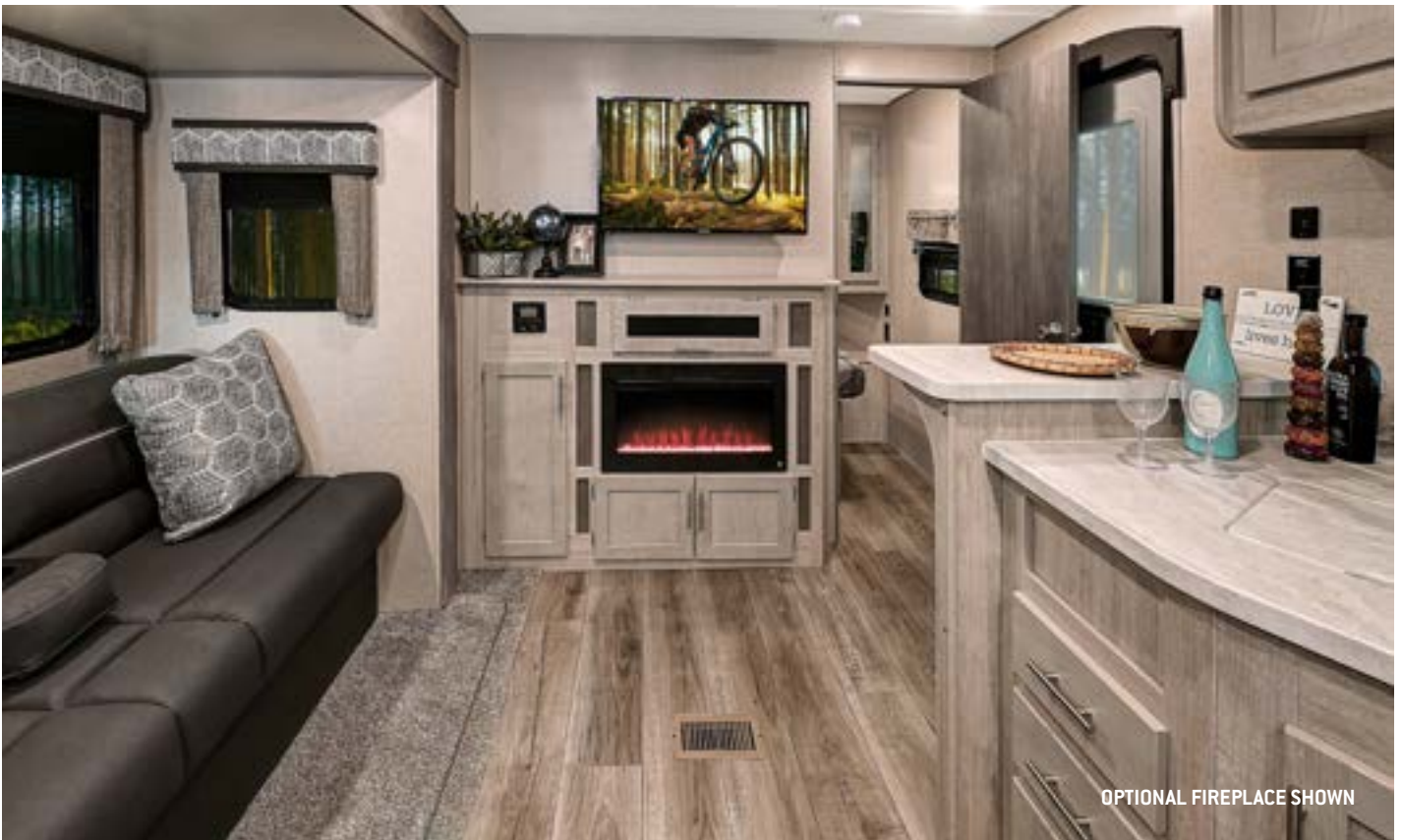
OPTIONAL FIREPLACE SHOWN

The popular 243RBS is the ideal couple's coach! This floor plan boasts a full size super slide with both a dinette and sofa, a spacious rear bathroom with a walk-in shower, extra-large pantry/wardrobe storage, a breakfast bar and private bedroom. The half-ton friendly towing weight and under 30' real length makes this camper perfect for cross country travel or local weekend getaways!