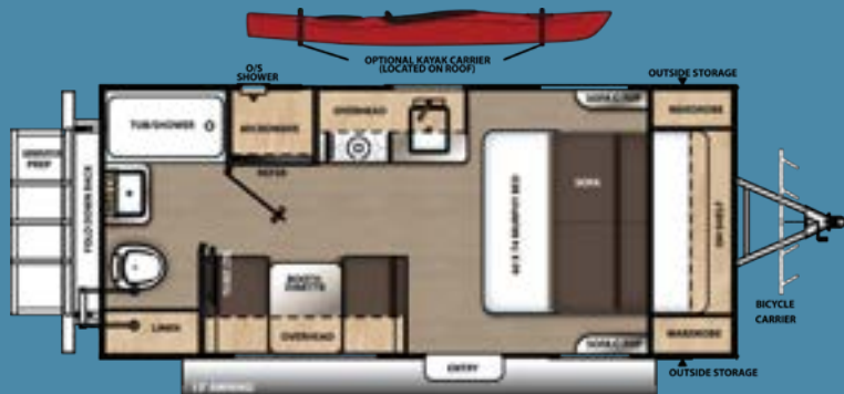
192RB TEMPORARILY UNAVAILABLE*