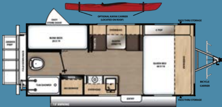
192BH TEMPORARILY UNAVAILABLE*