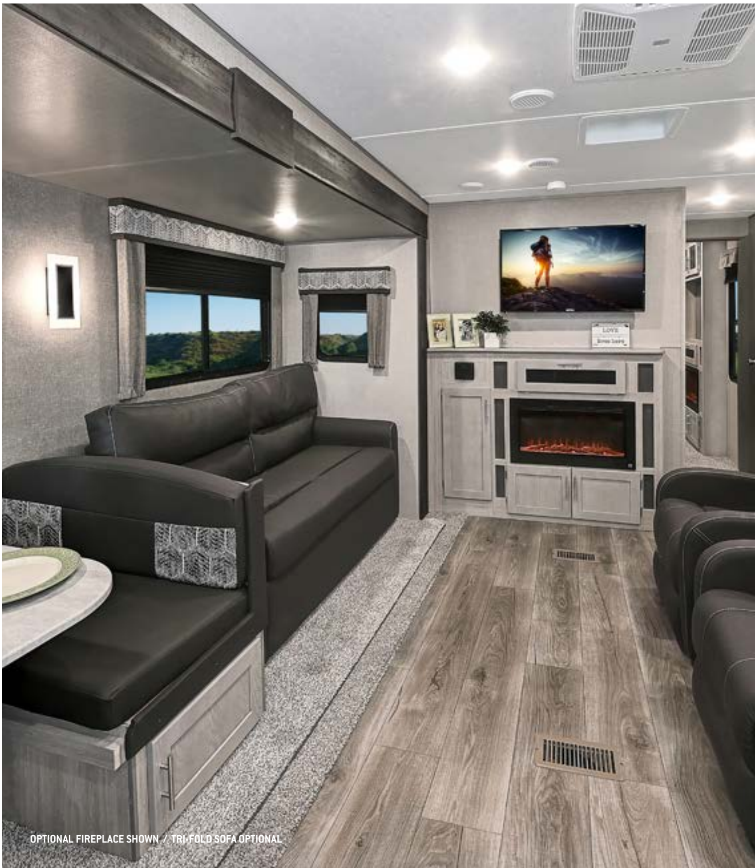
OPTIONAL FIREPLACE SHOWN / TRI-FOLD SOFA OPTIONAL

The rear kitchen 303RKDS steals the show with expansive counter space and abundant overhead storage. The location of the kitchen allows for a very spacious living room that includes two recliners directly across from the slide out sofa. An extra-large picture window opposite of the large slide out offers views and natural lighting.