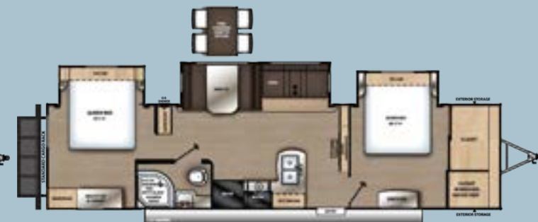
343BHTS (2 QUEEN)