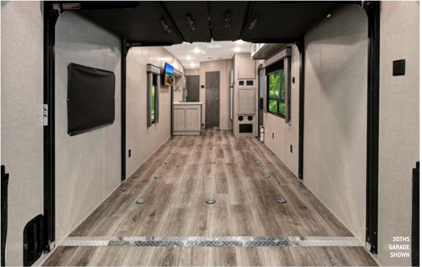
30THS GARAGE SHOWN

Affordable toy haulers are not just a dream anymore! Our Trail Blazer 28THS and 30THS layouts offer large open garages for total versatility in what you want to haul, a highlight to the 16' of clear space in the award winning 30THS. Higher ceilings, standard Happijac bed systems, a 98 gal. fresh water tank, and optional 30 gal. on-board fuel station really makes for the ultimate experience anywhere your travels take you.