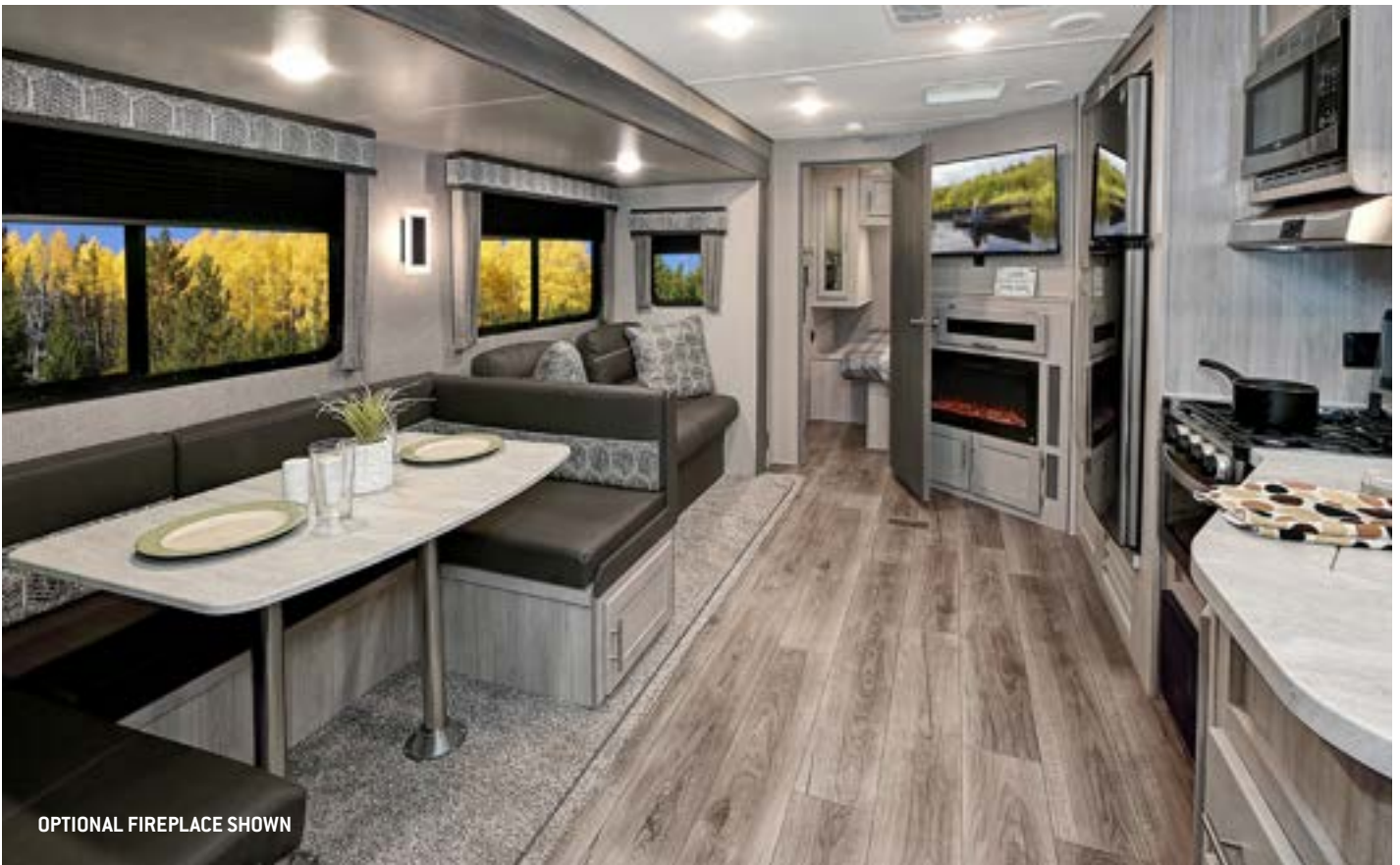
OPTIONAL FIREPLACE SHOWN

The 263BHCK is a classic family bunkhouse floor plan with a modernized design. Plenty of sleeping is provided for 6-10 from the two spacious double over double bunk beds, extra-large U-shaped dinette, jiffy bed sofa and master queen. Every accommodation was thought out with family in mind including the easy view angled entertainment center, generous kitchen pantry, standard outside camp kitchen.