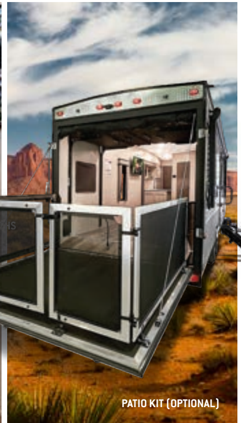
PATIO KIT (OPTIONAL)