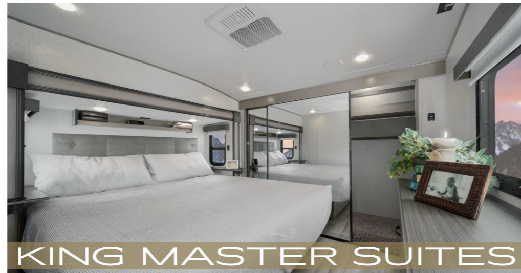
KING MASTER SUITES