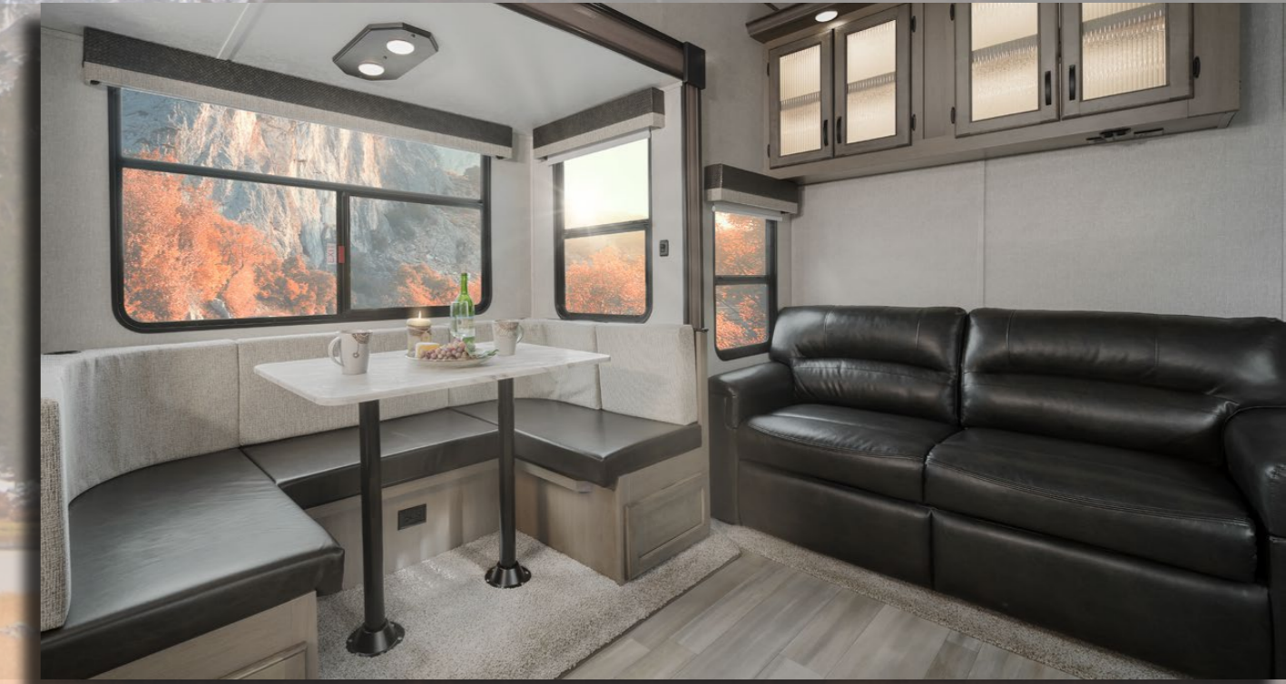
Mahogany Bay Decor

Chaparral's 2nd decor option maintains our beautiful Dove Grey L.E.D. back lit cabinetry* with a darker ebony seating & valance choice called Mahogany Bay. The contrast between the cabinetry & seating areas provides a stunning, modern look, in a more family friendly (even husband-friendly) color palette.