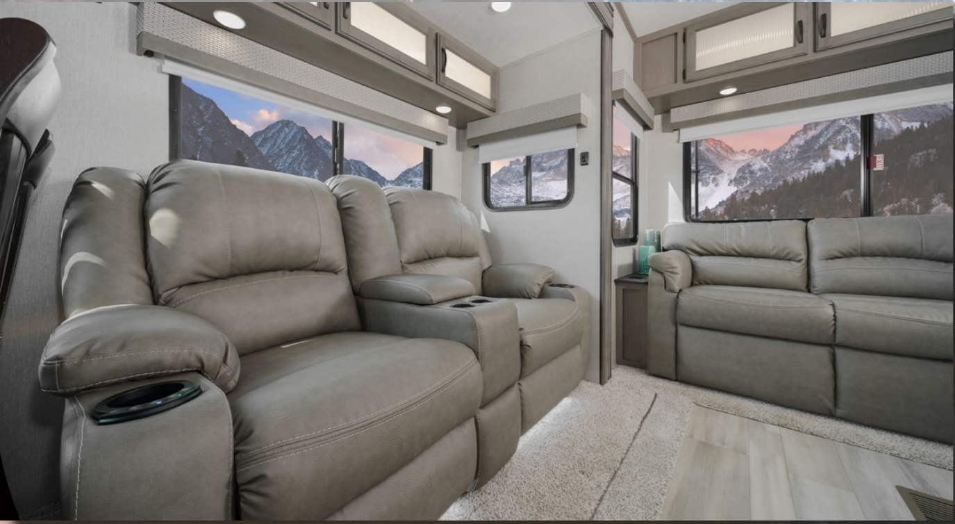
Silver Beach Decor

Chaparral's all new Silver Beach decor is sure to brighten your home away from home. Our beautiful Dove Grey L.E.D. back lit cabinetry* was selected by professional interior (female & male) designers who helped us take Chaparral into the next level of contemporary design, while maintaining a warm, inviting feeling throughout.