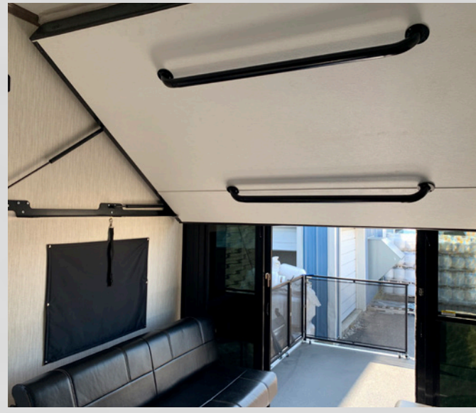
Quick Set Garage Bed