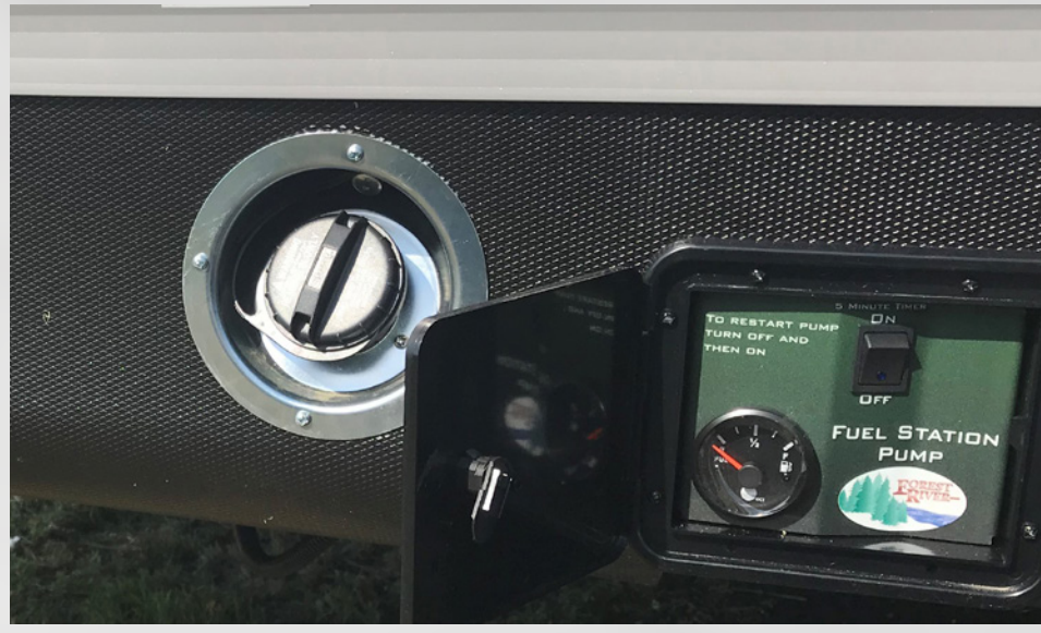
30 Gallon Fuel Station