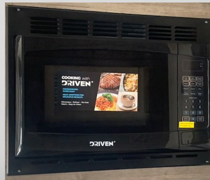
1,000 Watt Microwave