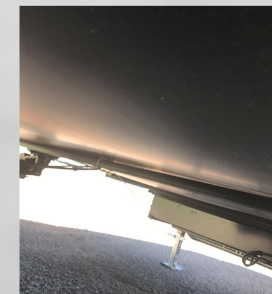
Armored Heated Underbelly