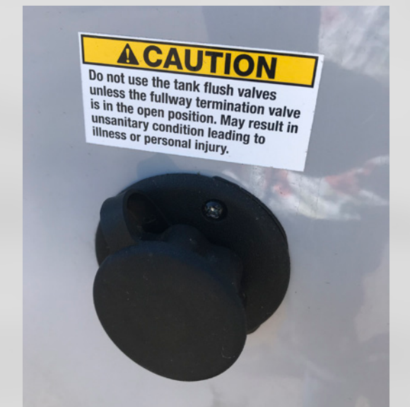
Black Tank Flush