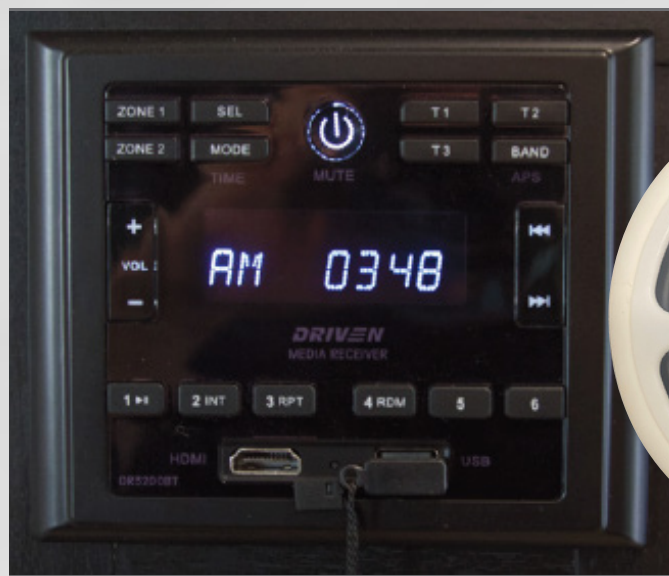
Bluetooth Stereo w/ 200W Subwoofer