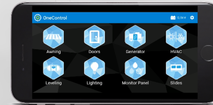
Total Control Phone App