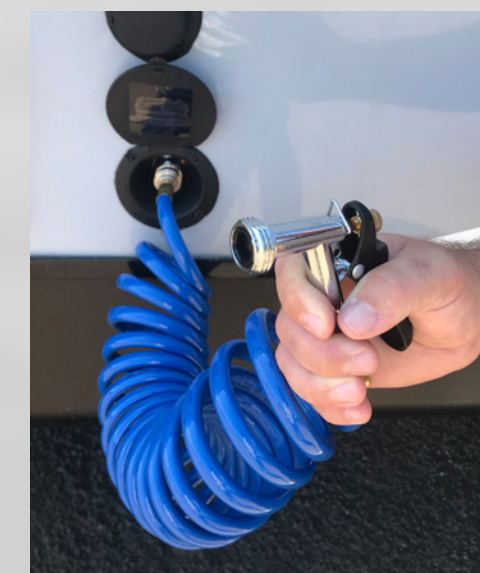
High Pressure Sprayer