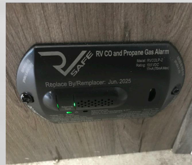
CO2 / LP Detector