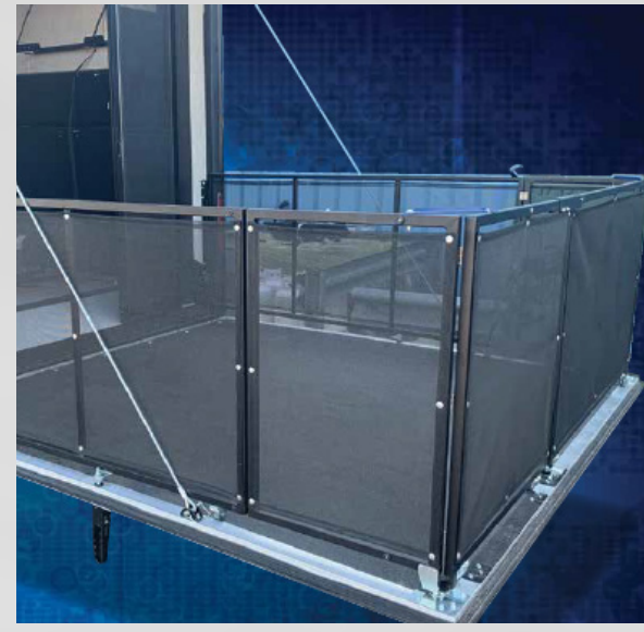
Ramp Door Patio