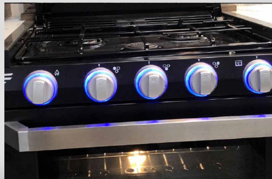
3 Burner Cooktop w/ Oven