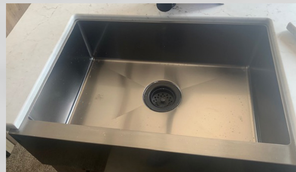
Large Farm Sink