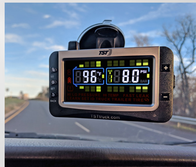
Tire Pressure Monitor System