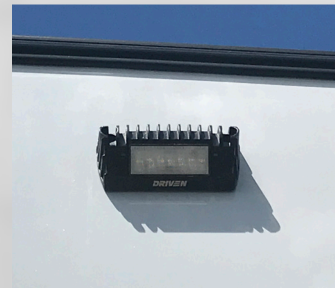
LED Rear Ramp Lights