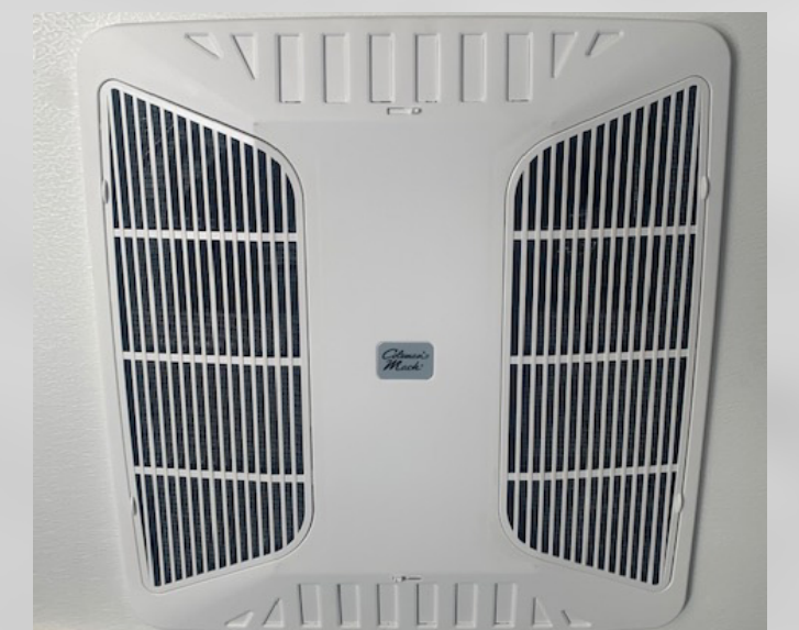
15M BTU A/C