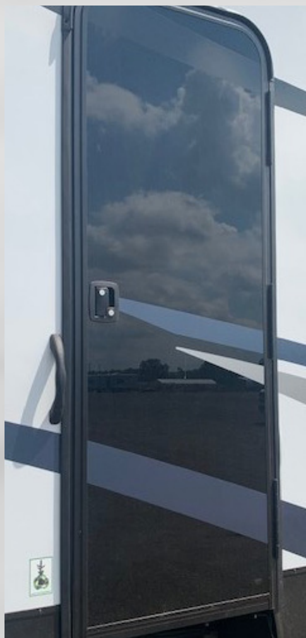
Black Glass Entry Doors