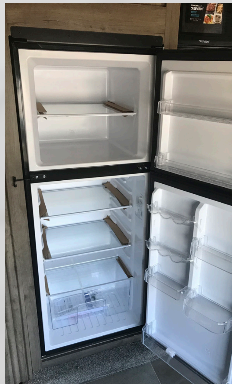
10 cu. ft. Refrigerator