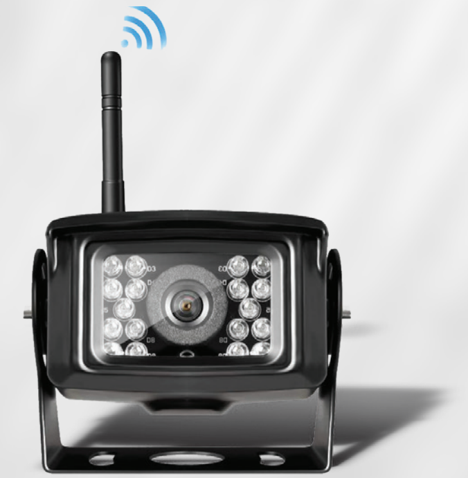
Rear Observation Camera