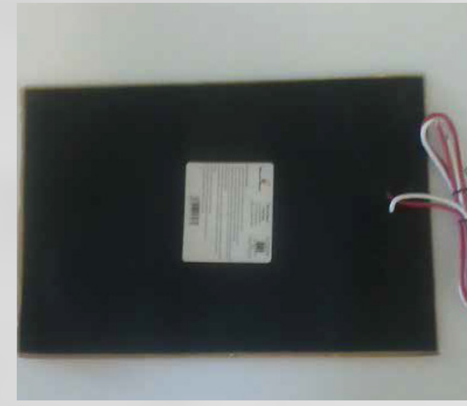
12V Heat Pads on Tanks