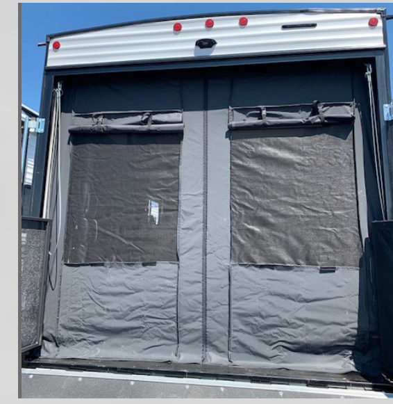
Rear Screen Wall