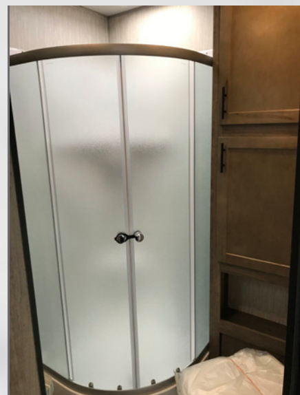
Glass Shower Surround (NA 32V)