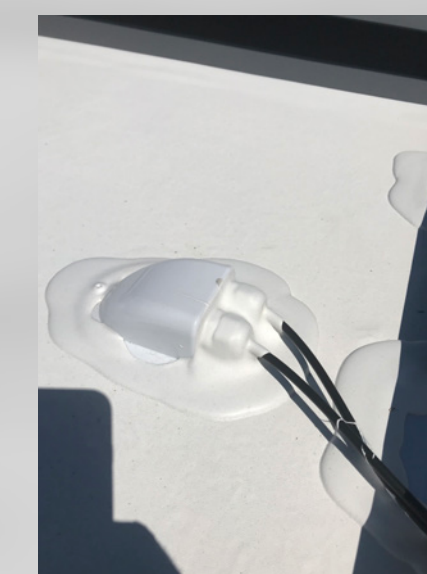
Solar Panel Ready