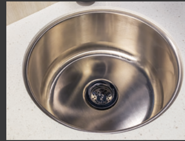
Deep Stainless Steel Sink