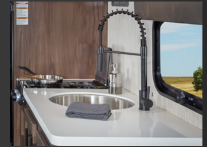
Residential Pullout Faucet