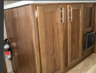
Solid Wood Cabinet Doors