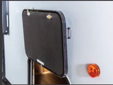
Hands Free Baggage Door Catch