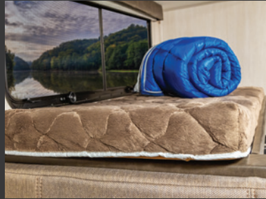
Oversized Bunk Pads