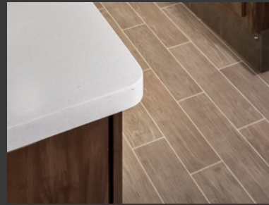
LG Solid Surface Countertop