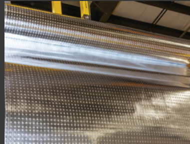
Thermo-Foil Arctic Insulation