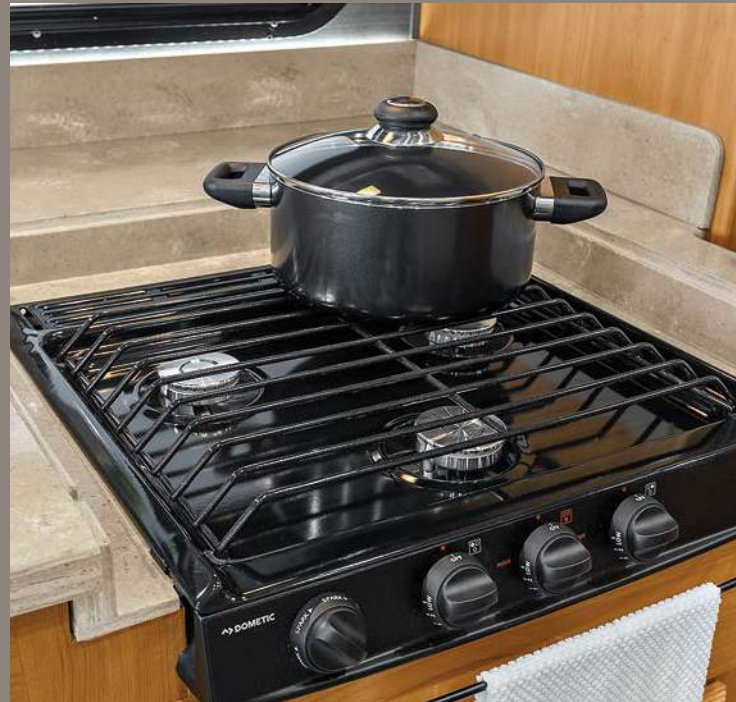
Top to bottom: Sink; 3-burner cooktop.