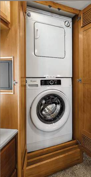
Clockwise from top: Master Bathroom vanity; Optional Stacked Washer and Dryer; Shower.