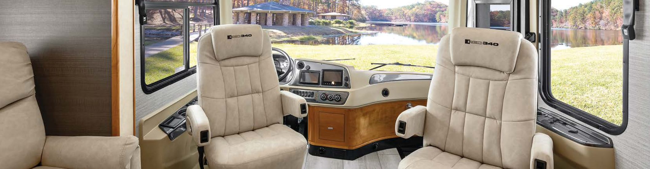
Clockwise from top: Cockpit; Passenger Side Dinette; Dashboard; Master Bed. All interiors shown are Natural Alder cabinets, Sand Bar II décor.