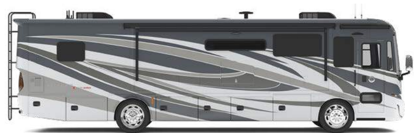
G1 SLATE GRAY