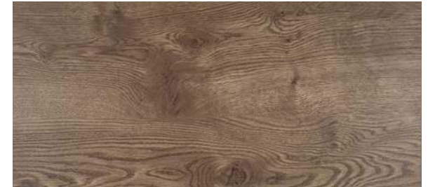
SEA OAT (O)