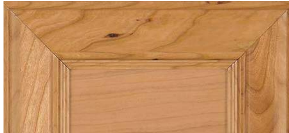
NATURAL ALDER (O)