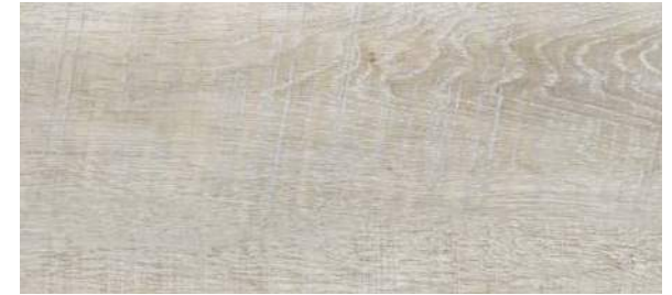
SAND CASTLE (S)