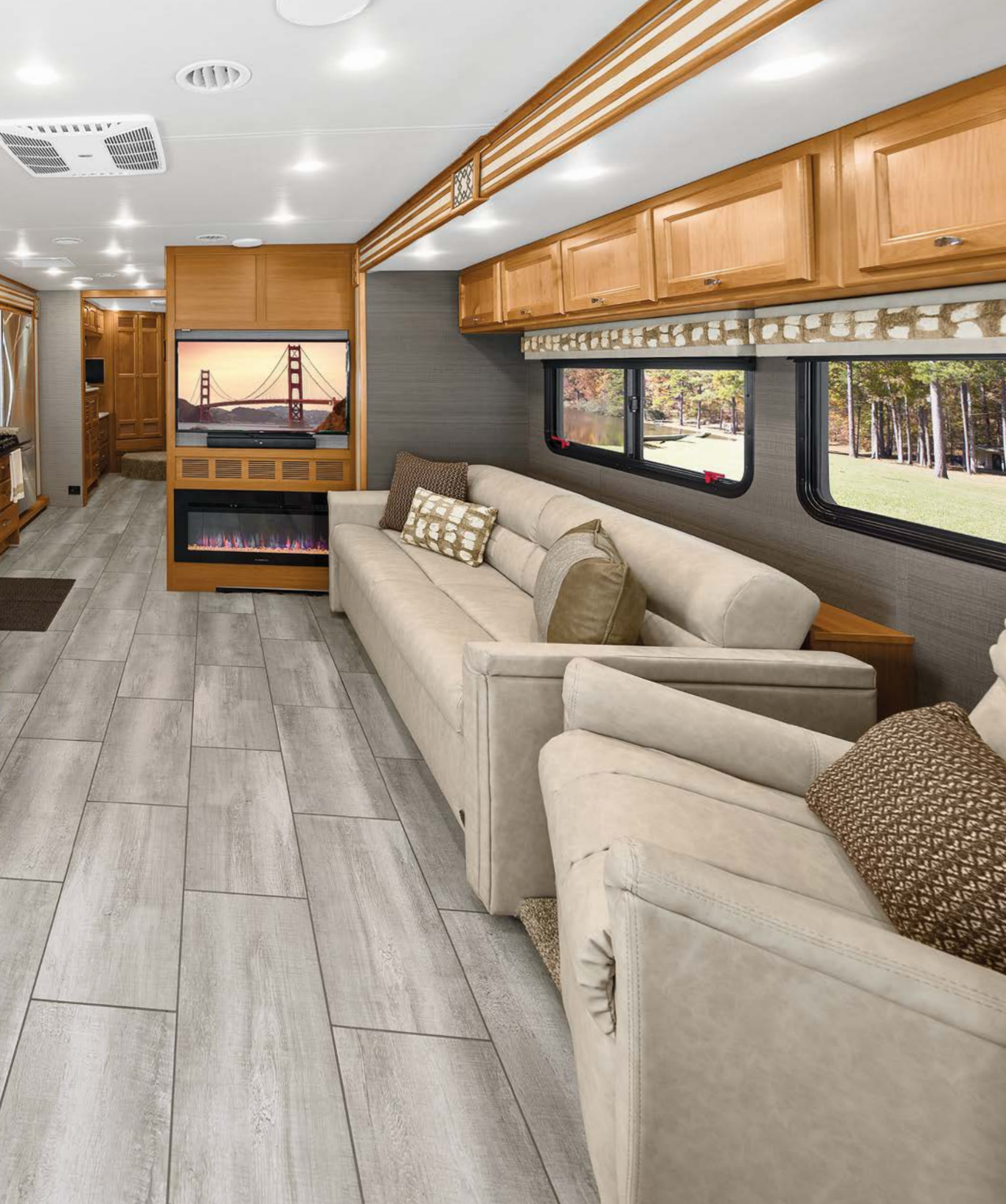
Top to bottom: Living Area; Sofa with optional Fireplace; Sofa bed expanded.