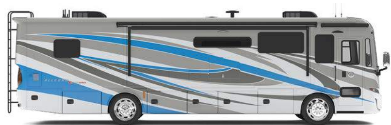
G1 GLACIER BLUE