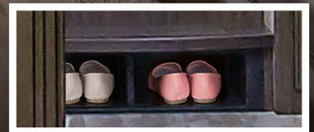
Under Stair Shoe Storage

No other extended stay fifth wheel delivers the size and luxury of our flagship Solitude – earning a loyal following with its legendary quality and its effortless functionality. The all-new Solitude S Class delivers all the spaciousness, and elegant finishes to an even wider market. Our team of designers created industry-leading floorplans while maintaining the craftsmanship and elegance Grand Design owners have come to expect. (372WB shown)