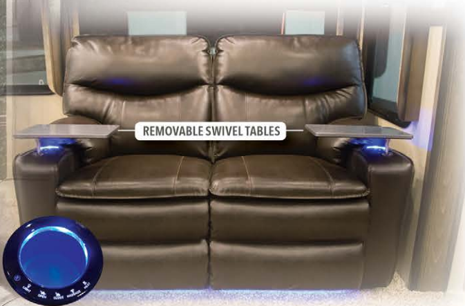
REMOVABLE SWIVEL TABLES

The most spacious EXTENDED STAY FIFTH WHEEL EVER BUILT!