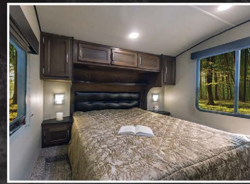
Residential Master Suite (230RL Shown)