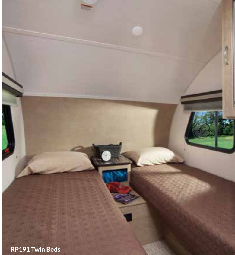
RP191 Twin Beds