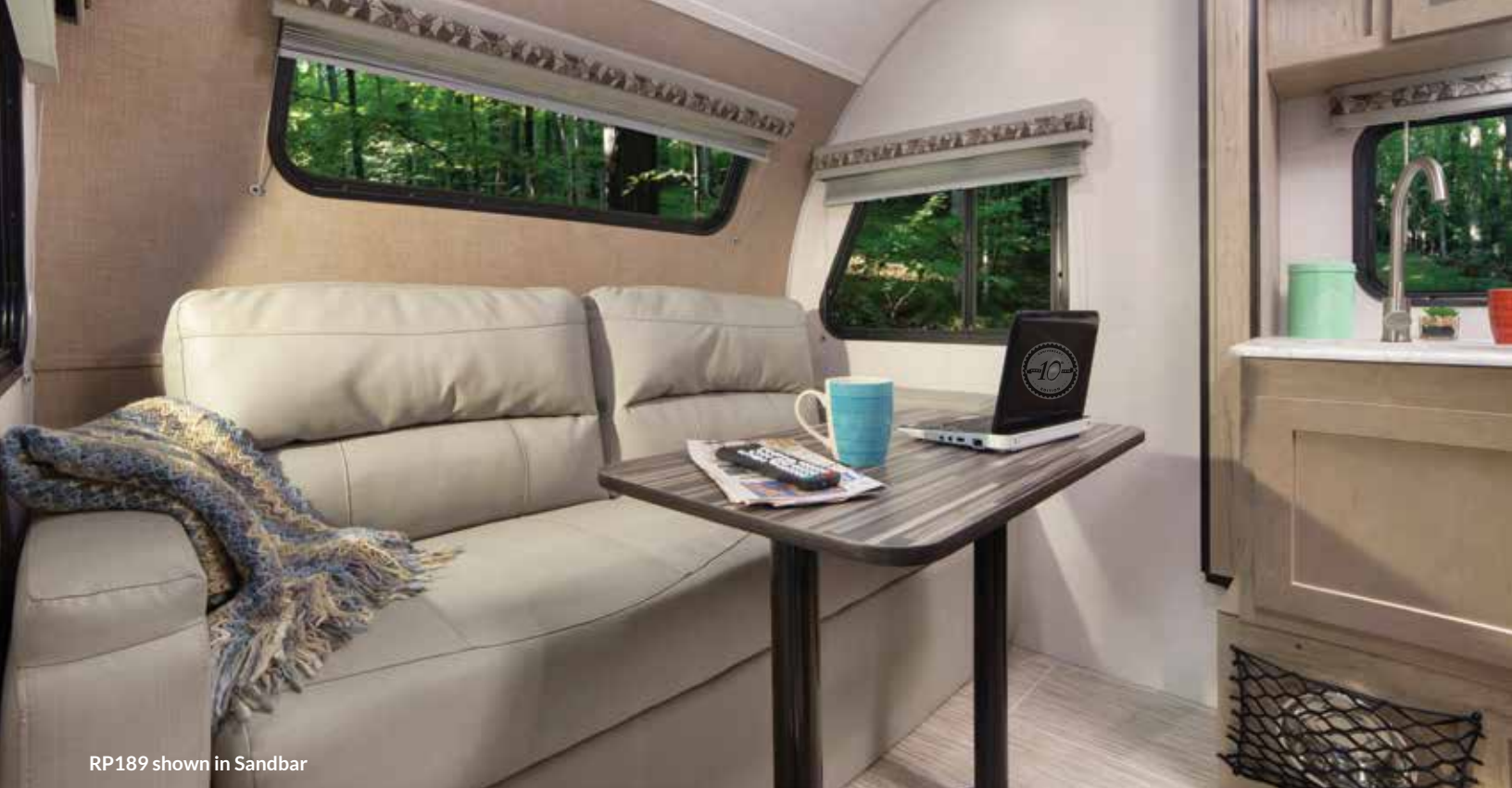
RP189 shown in Sandbar