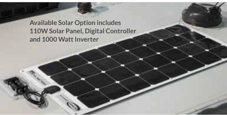
Available Solar Option includes 110W Solar Panel, Digital Controller and 1000 Watt Inverter