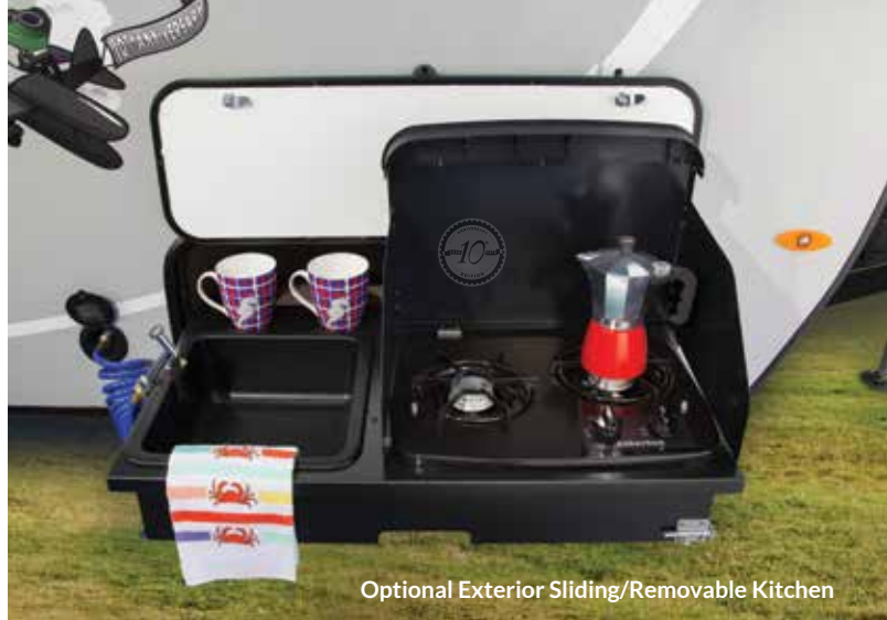
Optional Exterior Sliding/Removable Kitchen

R•pod is celebrating it's 10th anniversary and we want you to be a part of the adventure. Sure, r•pod is affordable and has the lowest tow weight in its class, but you'll also love it's unique shape and construction. This fun pod comes standard with a 3.7 cu. ft. 3-way refrigerator to hold enough for those extended adventures. The interior has residential cabinetry, hardwood drawers and expandable cargo netting to stow movies or games when the elements keep you inside. After a fun-filled day of exploring, enjoy the convenience of the optional, removable outdoor kitchen under the LED lighted awning.