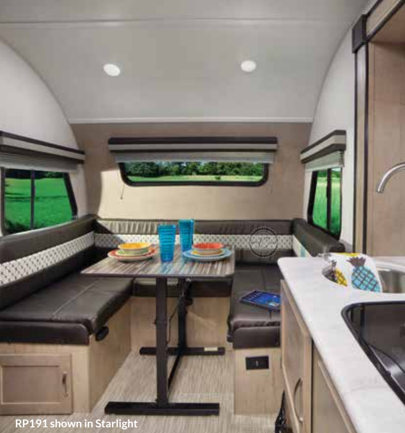
RP191 shown in Starlight