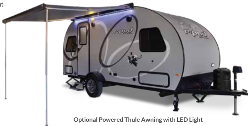
Optional Powered Thule Awning with LED Light

R•pod is celebrating it's 10th anniversary and we want you to be a part of the adventure. Sure, r•pod is affordable and has the lowest tow weight in its class, but you'll also love it's unique shape and construction. This fun pod comes standard with a 3.7 cu. ft. 3-way refrigerator to hold enough for those extended adventures. The interior has residential cabinetry, hardwood drawers and expandable cargo netting to stow movies or games when the elements keep you inside. After a fun-filled day of exploring, enjoy the convenience of the optional, removable outdoor kitchen under the LED lighted awning.