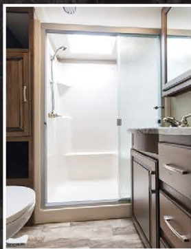
Spacious Master Bath (Bed slide models shown)

Nev-R-Adjust brakes, bronze bushings and wet bolts, rubberized suspension equalizer