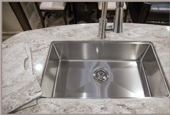
Deep seated stainless steel farmers sink