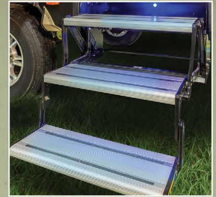
ALUMINUM ENTRY STEPS 100% Aluminum, easy open... won't rust or bind.