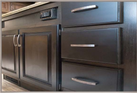
Kitchen island with bank of drawers