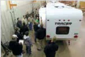
Executive Quality Audits