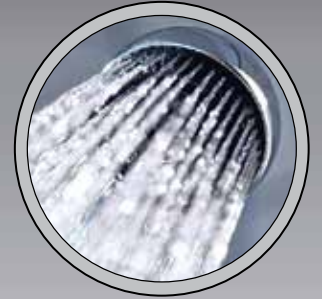
18 GPH DSI WATER HEATER