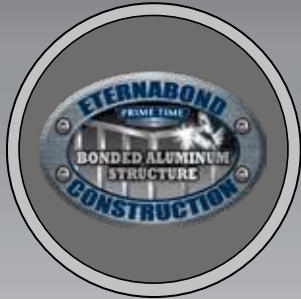
EXCLUSIVE ETERNABOND® CONSTRUCTION