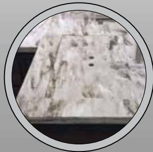
SOLID SURFACE COUNTERTOPS