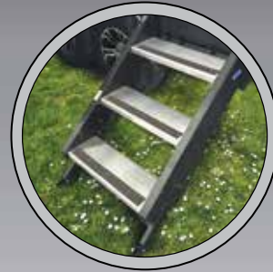
MORryde "STEP ABOVE" ZG ENTRY STEPS