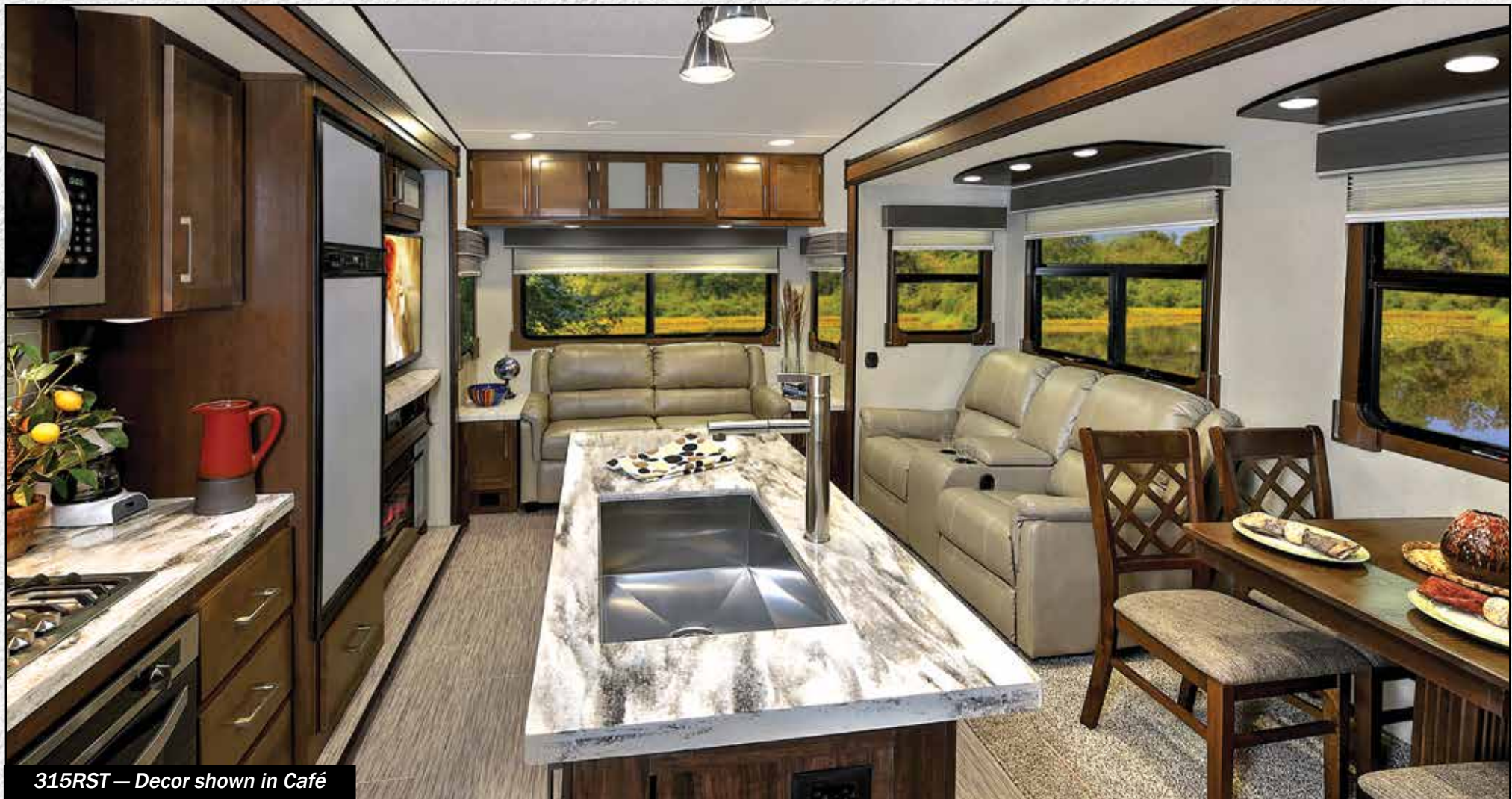
315RST — Decor shown in Café

The result of their efforts represents a new standard in fifth wheels — A HIGHER STANDARD — Crusader.