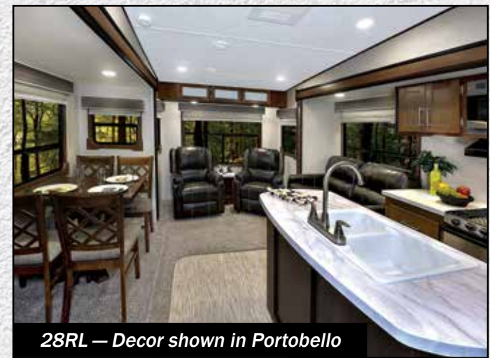
28RL — Decor shown in Portobello