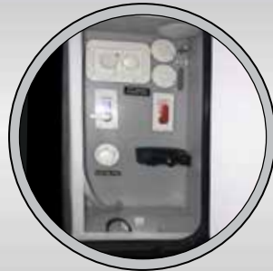
UNIVERSAL DOCKING CENTER