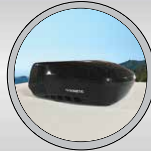
15K "QUIET COOL" A/C