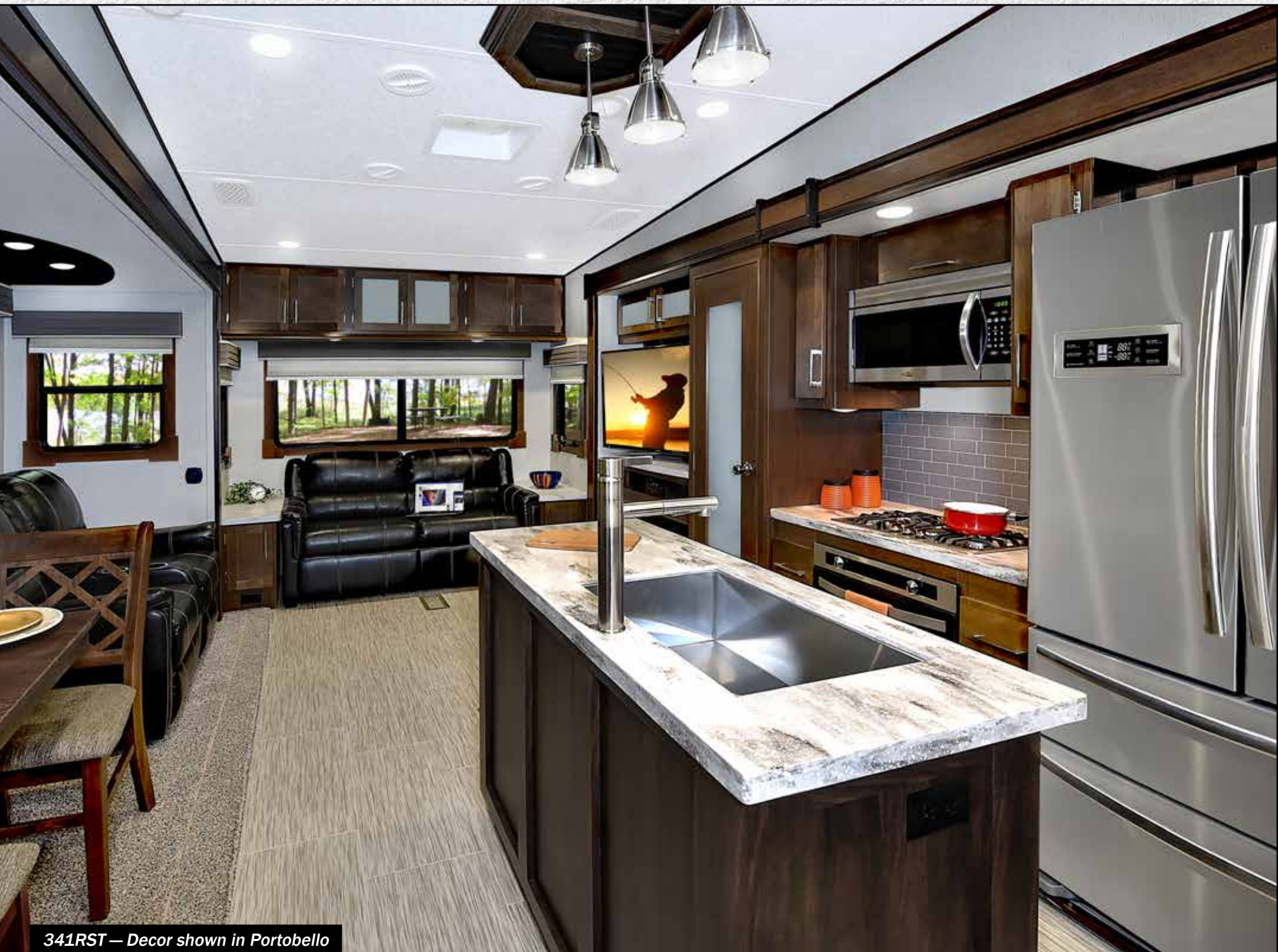
341RST — Decor shown in Portobello