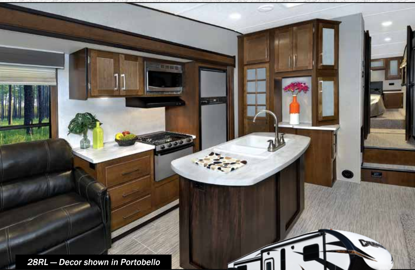
28RL — Decor shown in Portobello