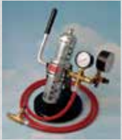
Seek-A-Leak Pressure Test

Prime Time Manufacturing is proud to be recognized as an industry leader in value, reliability, and overall quality by the Recreational Vehicle Dealers Association. We are committed to "A Higher Standard" in design, construction, testing, and customer service. Check us out – we know you'll be impressed!