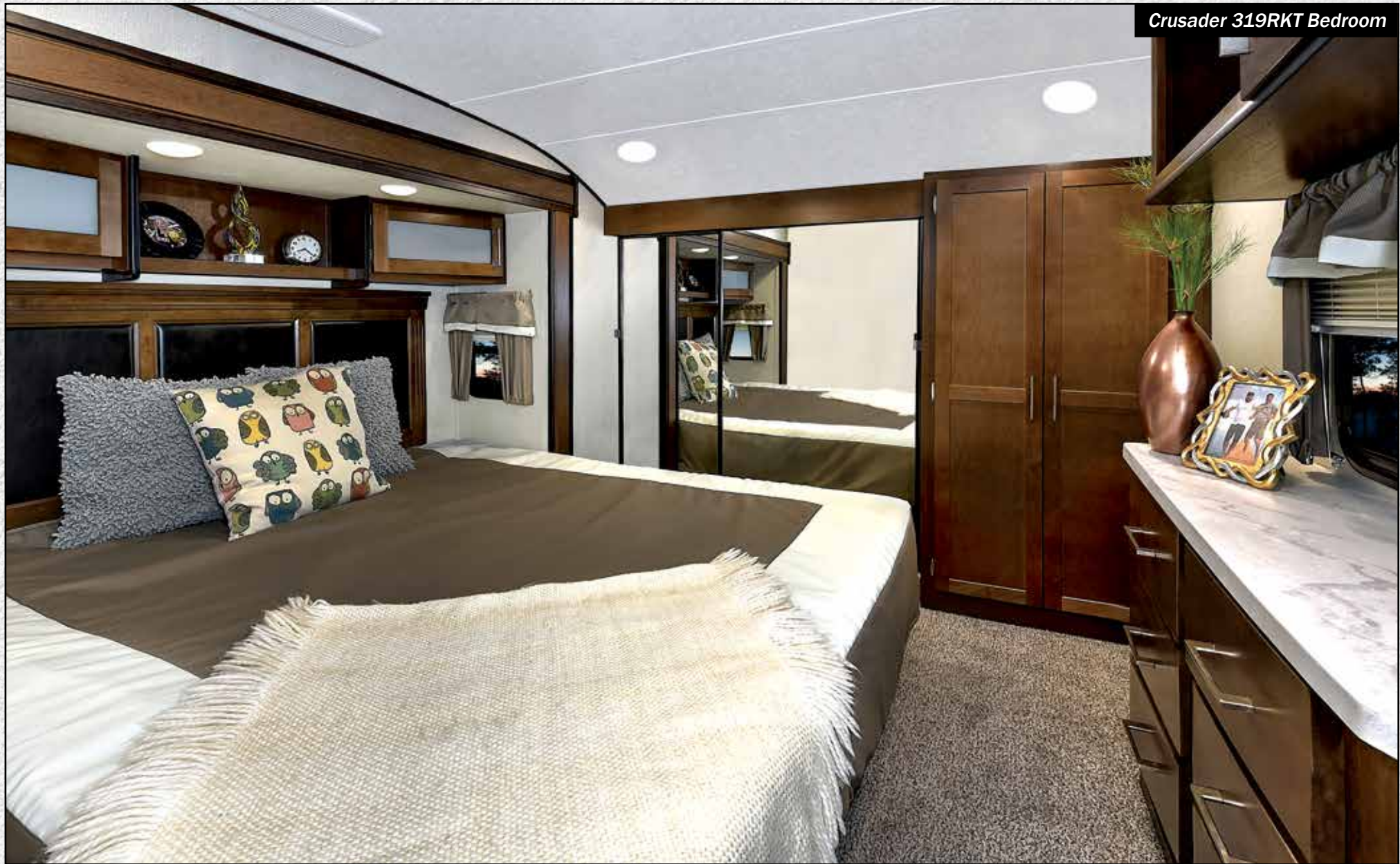
Crusader 319RKT Bedroom

Crusader bedrooms are built for comfort and convenience. Every Crusader model features large 60" x 80" Ever Rest® select foam beds while several models come with a king bed option. Crusader bedrooms feel spacious and roomy due to our tall ceilings, they have large storage closets, and our bedroom slide-out models come with the added convenience of being washer and dryer ready. Everywhere you look, there are numerous upgrades that will make your Crusader the envy of the campground.