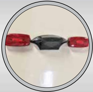
BACK UP CAMERA PREP