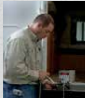
65 Point Secondary PDI