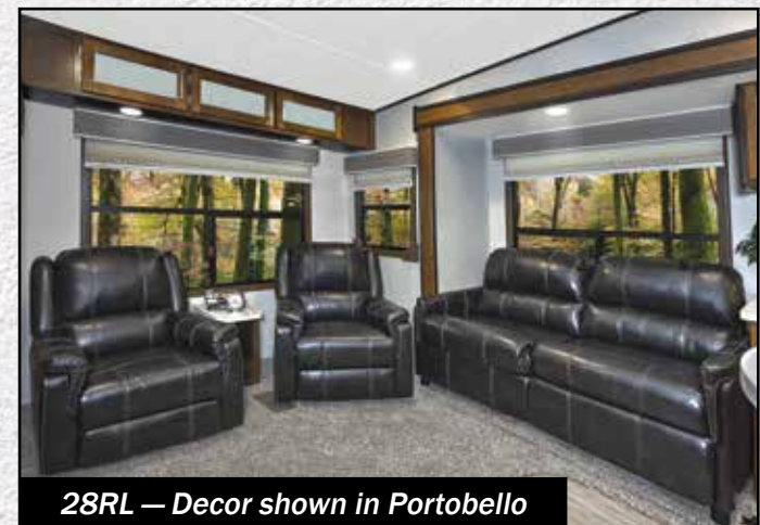
28RL — Decor shown in Portobello

See back page for additional specification definitions.