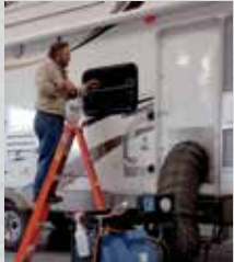
Seal Tech Air Pressure Test