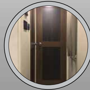
SHAKER STYLE INTERIOR DOORS