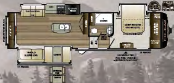
WEIGHT 10195 LENGTH 35' 6" 311RES