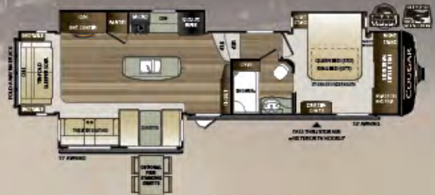
WEIGHT 10795 LENGTH 38' 1" 344MKS