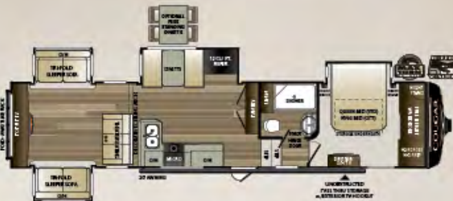
WEIGHT 11230 LENGTH 40' 1" 366RDS