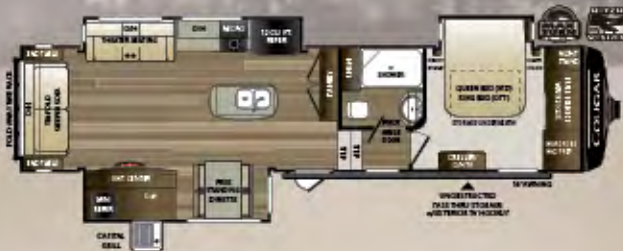
WEIGHT 10640 LENGTH 37' 2" 338RLK