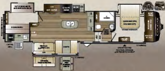
WEIGHT 11310 LENGTH 40' 2" 369BHS