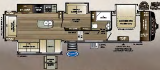
WEIGHT 11535 LENGTH 40' 1" 368MBI