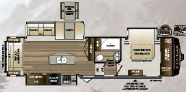
WEIGHT 10055 LENGTH 35' 4" 310RLS