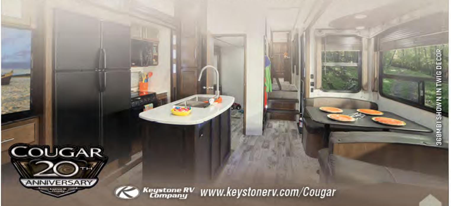
368MBI SHOWN IN TWIG DECOR

Cougar remains focused on the growing popularity of lightweight luxury vehicles, and the ease of tow ability. We have ongoing commitment to create a stress free journey for all who choose to explore with us. We make it our goal that our current customers choose us for each of their subsequent voyages. Come grow with us and explore the country in a Cougar RV! Where you are always a step ahead, and luxury and lightweight meet!