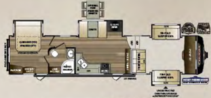
WEIGHT 11025 LENGTH 40' 1" 367FLS