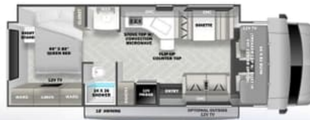
3050S (Available on Ford E450)