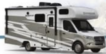
PLATINUM Full body paint (also available on Transit)