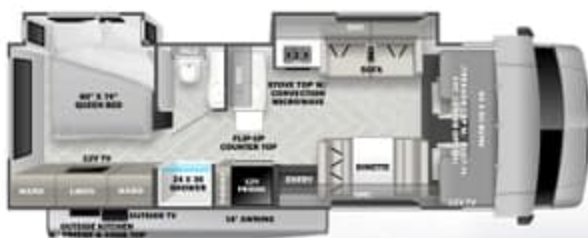
2860DS (Available on Ford E450)