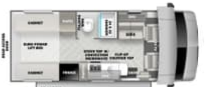
2030RP (Dodge ProMaster 3.6L V6 AWD)