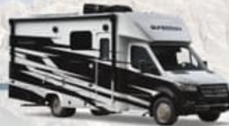
ONYX Full body paint (also available on Transit)