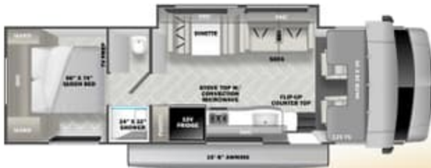
2850SLE (Available on Ford E450)