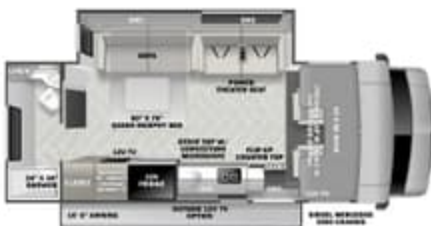
2400T (Available on Sprinter 3500)