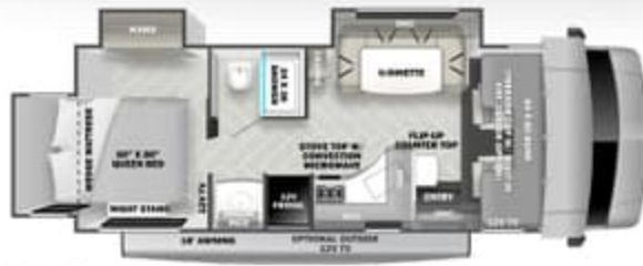
2500TS (Available on Ford E450)