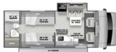
TS2370 (Ford EcoBoost 3.5L gas engine)