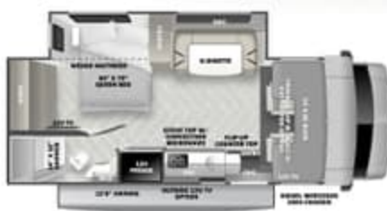
2400B (Available on Sprinter 3500)