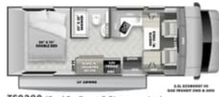
TS2380 (Ford EcoBoost 3.5L gas engine)