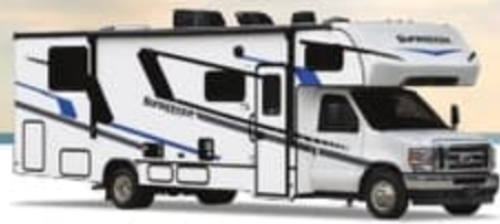
STANDARD Exterior graphics (Standard on LE, Classic, MBS & TS Models)