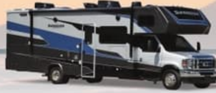
PACIFIC Full body paint