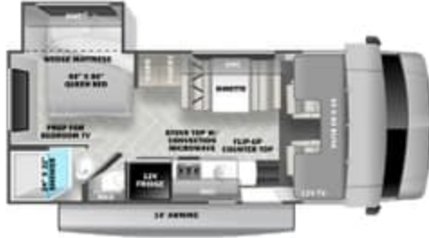
2250SLE (Available on Ford E350/Chevy 3500)