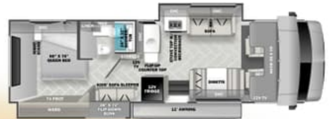
3250DSLE (Available on Ford E450)