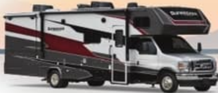
GARNET Full body paint