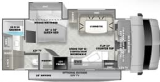
2440DS (Available on Ford E450)