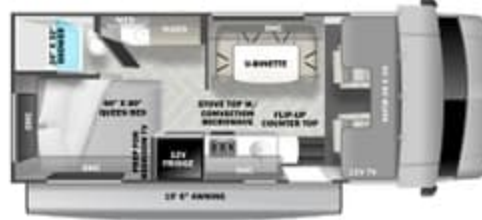
2350SLE (Available on Ford E350/Chevy 3500)