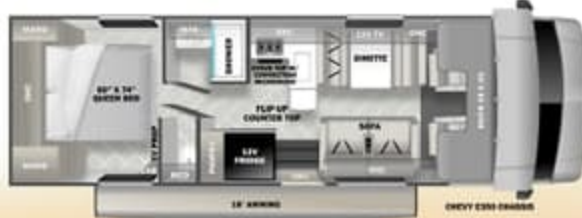
2950SLE (Available on Ford E450)