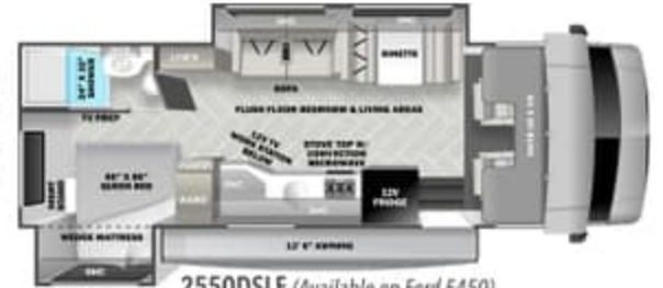
2550DSLE (Available on Ford E450)