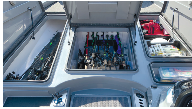
*Pictured boats may have optional equipment

features that you could ask for in a tournament boat, allowing you to always stay one step ahead of your competitors. Check out the CX 21 Pro at your closest dealer todau!