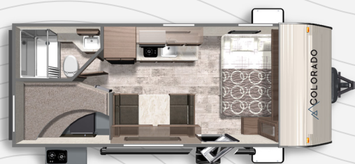
COLORADO 19BHC Length: 23' 5" Weight: 3,672 lbs. Sleeps: 4-6 Hitch: 510 lbs. Height: 9' 11"