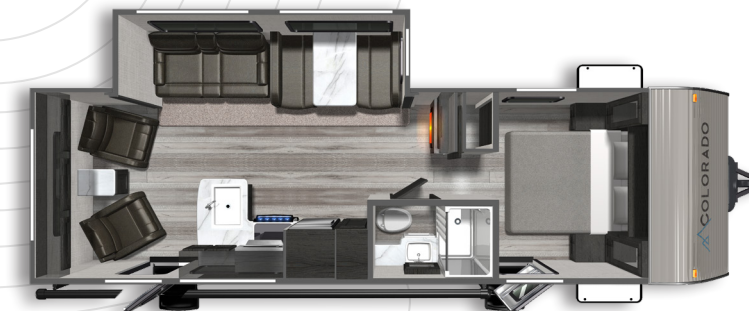
COLORADO 26RLC Length: 30' 11" Weight: 6,217 lbs. Sleeps: 2-4 Hitch: 761 lbs. Height: 11' 1"