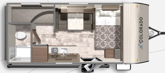
COLORADO 17BHC Length: 21' 5" Weight: 3,069 lbs. Sleeps: 4-6 Hitch: 396 lbs. Height: 9' 2"