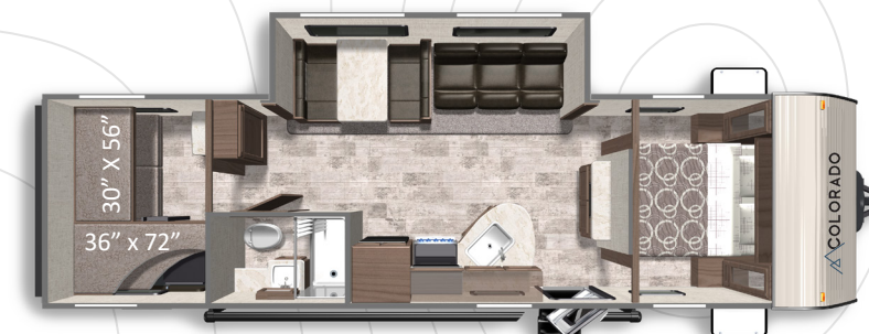
COLORADO 29BHC Length: 33' 3" Weight: 6,481 lbs. Sleeps: 7-9 Hitch: 821 lbs. Height: 11' 3"