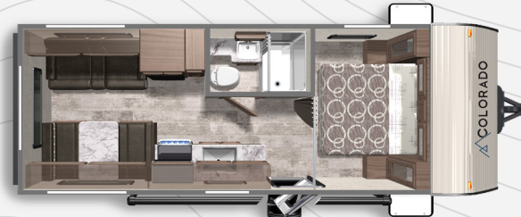
COLORADO 21RDC Length: 25' 5" Weight: 4,495 lbs. Sleeps: 4-6 Hitch: 602 lbs. Height: 11' 3"