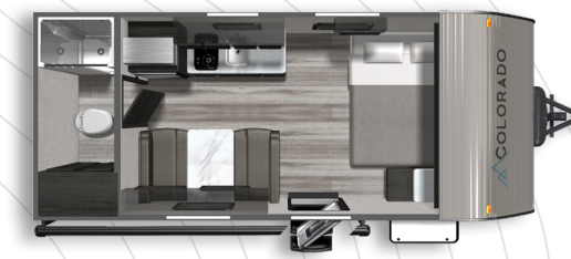
COLORADO 17RBC Length: 21' 3" Weight: 3,588 lbs. Sleeps: 2-3 Hitch: 548 lbs. Height: 9' 3"