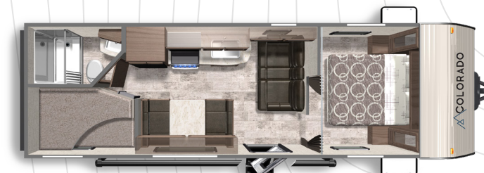
COLORADO 24BHC Length: 28' 8" Weight: 4,739 lbs. Sleeps: 6-8 Hitch: 487 lbs. Height: 10' 6"