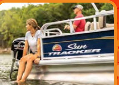
Rear boarding platform w/NEW 4-step telescoping boarding ladder & grab rails

9' (2.74 m) Bimini top w/LED courtesy light & protective boot