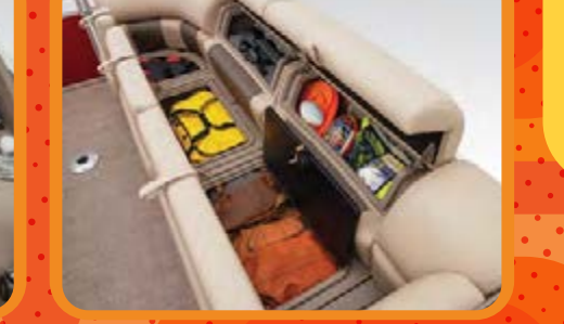
Starboard console couch w/STOW MORE™ & underseat lockable storage

Port wheelchair-accessible gate Driver console w/ SUN TRACKER FLARE™ touchscreen gauge display & 12-button switch panel