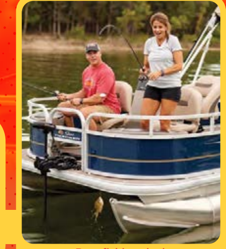
Bow fishing deck & twin fishing chairs