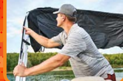
NEW 10' SUN TRACKER® QuickLift™ insert, 4 molded-in drink holders & 2 pedestal base locations Bimini top w/LED courtesy lights, storage pockets & protective boot