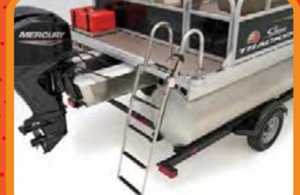
Rear boarding platform w/4-step telescoping boarding ladder & grab rails