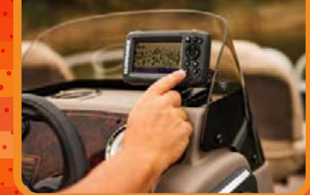
Optional Fishing package w/Lowrance® HOOK² 4x fishfinder