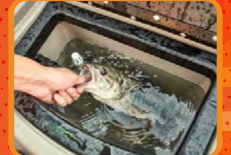
Aft rotomolded compartment w/8-gal. (30.28 L) aerated livewell