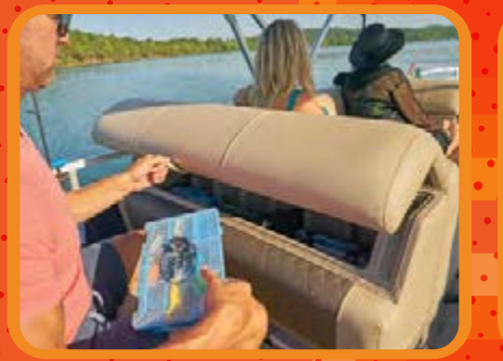
Aft fishing station STOW MORE™ tackle storage