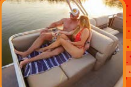
Aft port rear-facing double lounge w/STOW MORE™, underseat storage & pop-up changing room