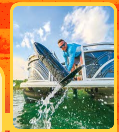
Optional Fishing Package includes Iinn Kota® PowerDrive™ trolling motor