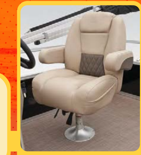
Adjustable & swiveling helm bucket seat