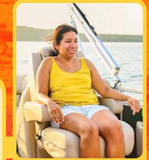
Reclining, high-back swiveling port bucket seat w/self-leveling armrests