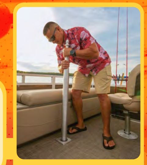
Optional ski tow pylon