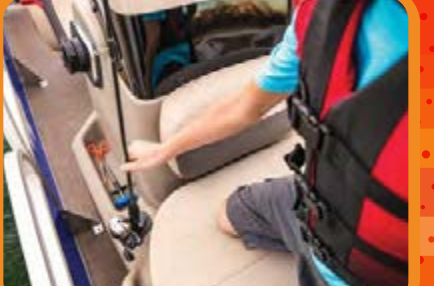
Integrated small items tray & vertical rod holder