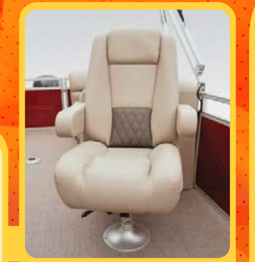
Reclining, high-back swiveling port bucket seat w/self-leveling armrests