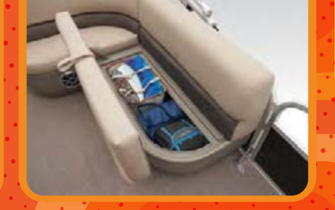
Aft L-lounge w/underseat storage