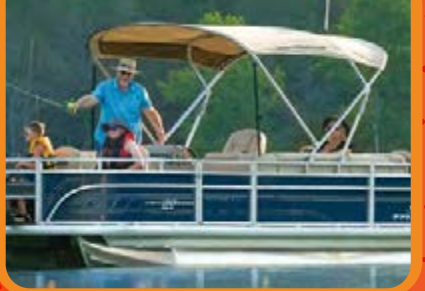
MEW 9' SUN TRACKER® QuickLift™ Bimini top w/LED courtesy lights, storage pockets & protective boot