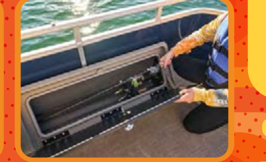
Molded aft starboard lockable rod box for 6 rods to 7' 6" (2.29 m) w/ lid, rod tube holders & organizer