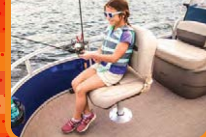
Bow fishing deck w/2 removable folding fishing chairs