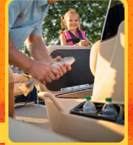
Forward-console 9-gal. aerated livewell