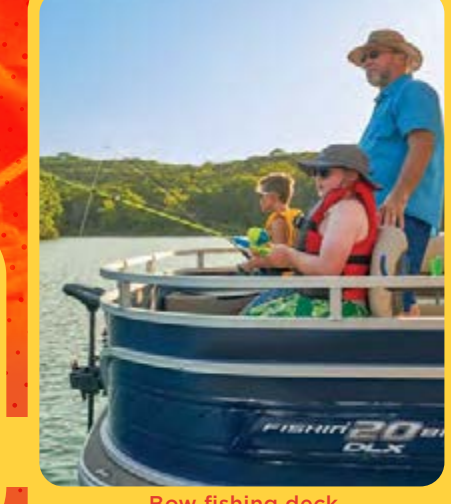
Bow fishing deck & twin fishing chairs