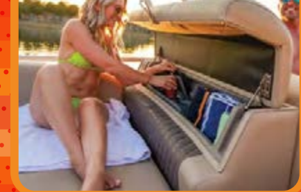
Built-in PATENTED STOW system for all couches See website for complete engine, specification and feature details.