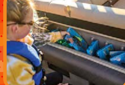
Aft fishing station STOW MORE™ tackle storage