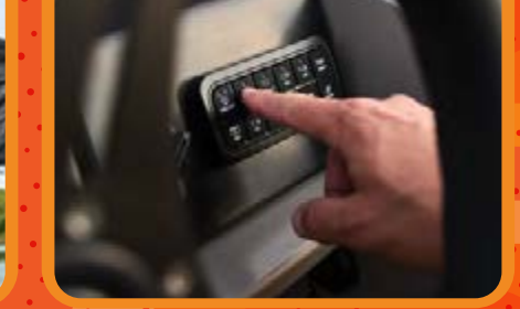
NEW driver console w/integrated storage & 12-button switch panel