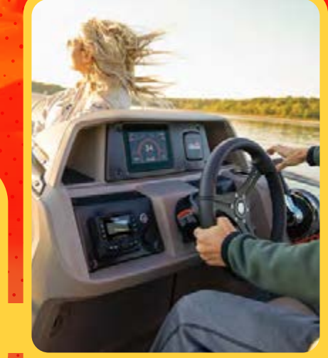
NEW driver console w/ SUN TRACKER FLARE™ touchscreen gauge display