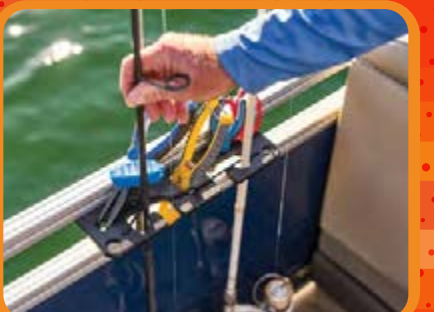
Bow rail-mounted vertical rod & tool holders