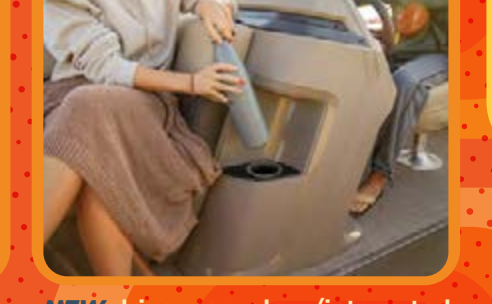
NEW driver console w/integrated drink holders & storage