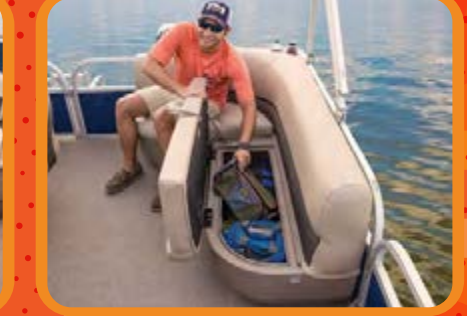
Aft L-lounge w/underseat storage