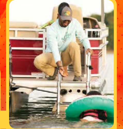
Aft 4-step telescopic reboarding ladder