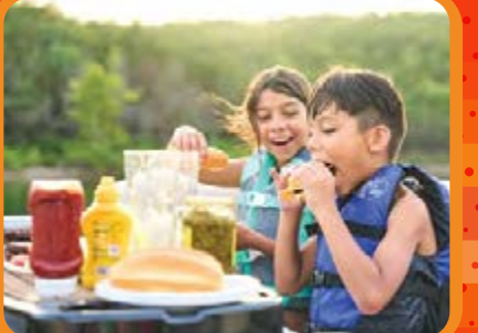
Removable table w/soft-touch