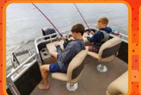
Aft fishing station 16-gal. aerated livewell w/removable bait bucket & shutoff valve