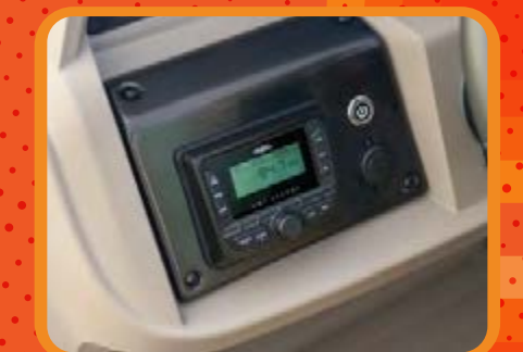
NEW Wet Sounds® stereo w/Bluetooth® & four 6.5" upholstery speakers