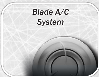
Blade A/C System