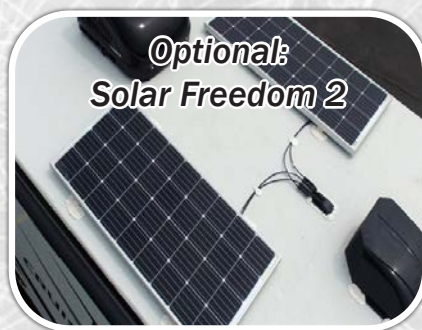
Optional: Solar Freedom 2