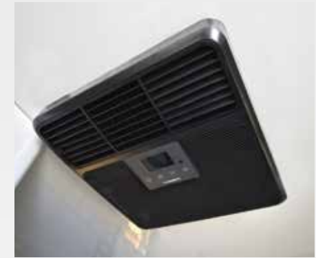
A/C - 12Volt - Keeping you cool without needing to be plugged in.