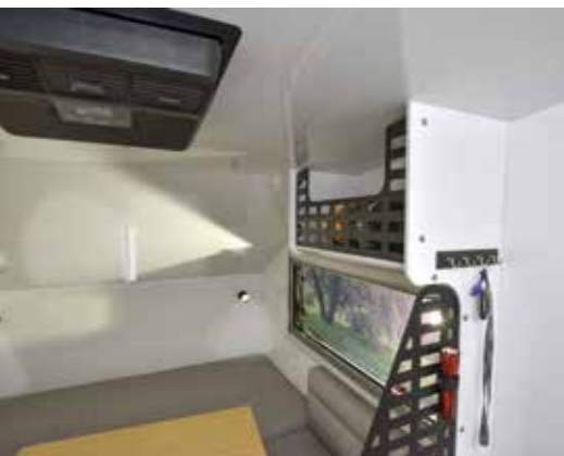
Euro-Ply™ cabinetry and interior walls are thick, lightweight and do not contain formaldehyde or "off-gas" like many other RVs. No facia board or thin trim. Go ahead and give it a knock!