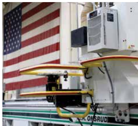
Full pressure pinch bonded walls, floor, and ceiling. Every exterior shell component is laminated using ultra high pressure. No trussing or dead space to allow heat/cold transfer or delamination.