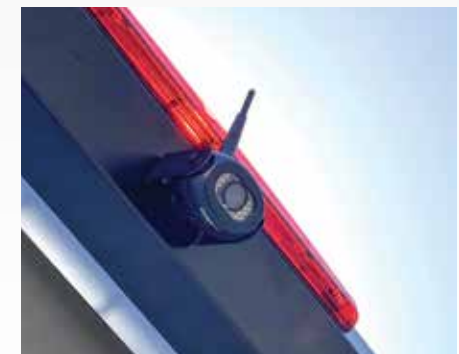
Wireless Rear Camera W/Color Display and Sound - Makes backing up effortless.