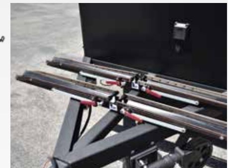
Bike Racks (2) W/ Frame Mounted Cable Lock & Key - Sturdy mounting and safe storage of your traditional or electric bicycle(s).