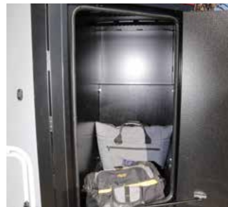
Aluminum exoskeleton and tongue mounted storage box with firewood rack are lightweight and become stronger as the temperature drops. Wheel wells, running boards/ rub rails and chassis made of high strength steel- sand blasted and powder coated to prevent rust.