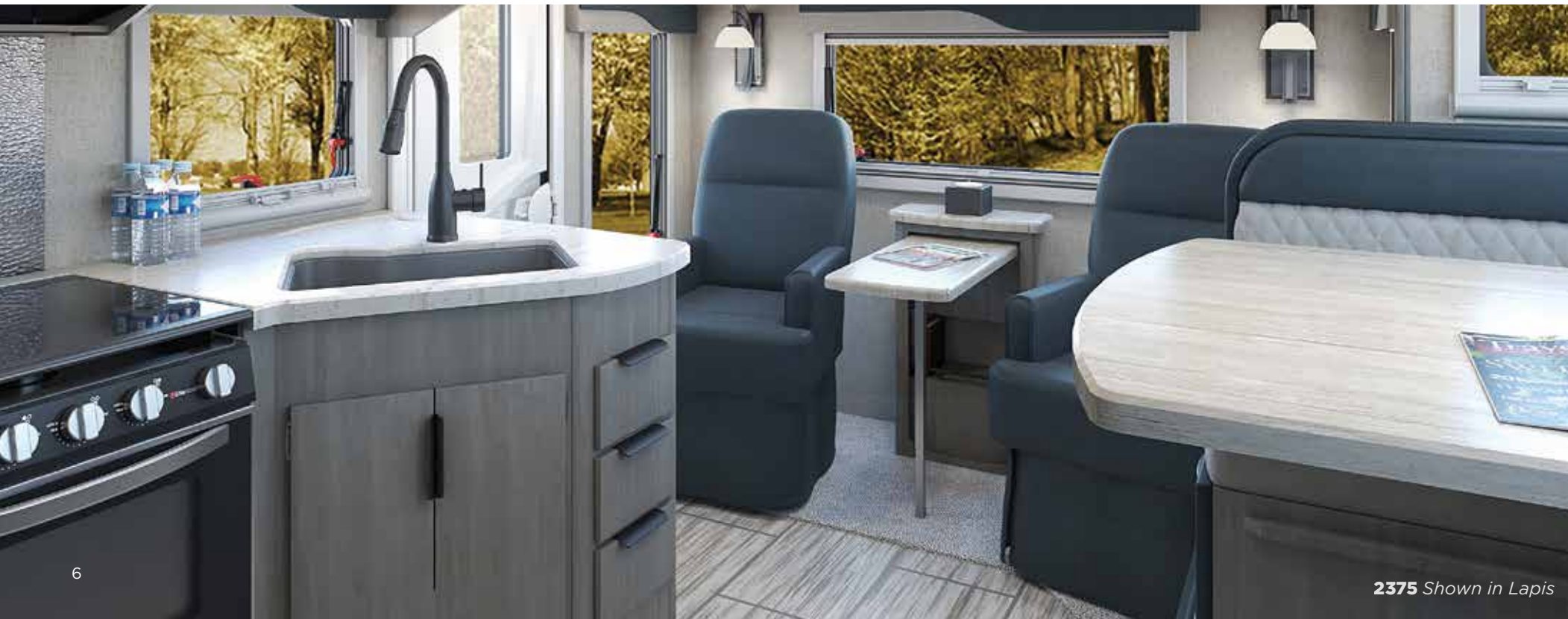
2375 Shown in Lapis