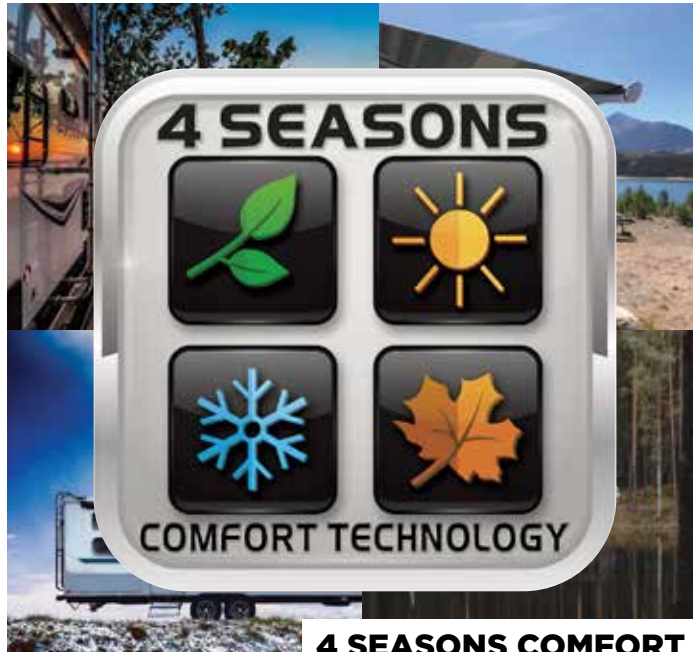
4 SEASONS COMFORT