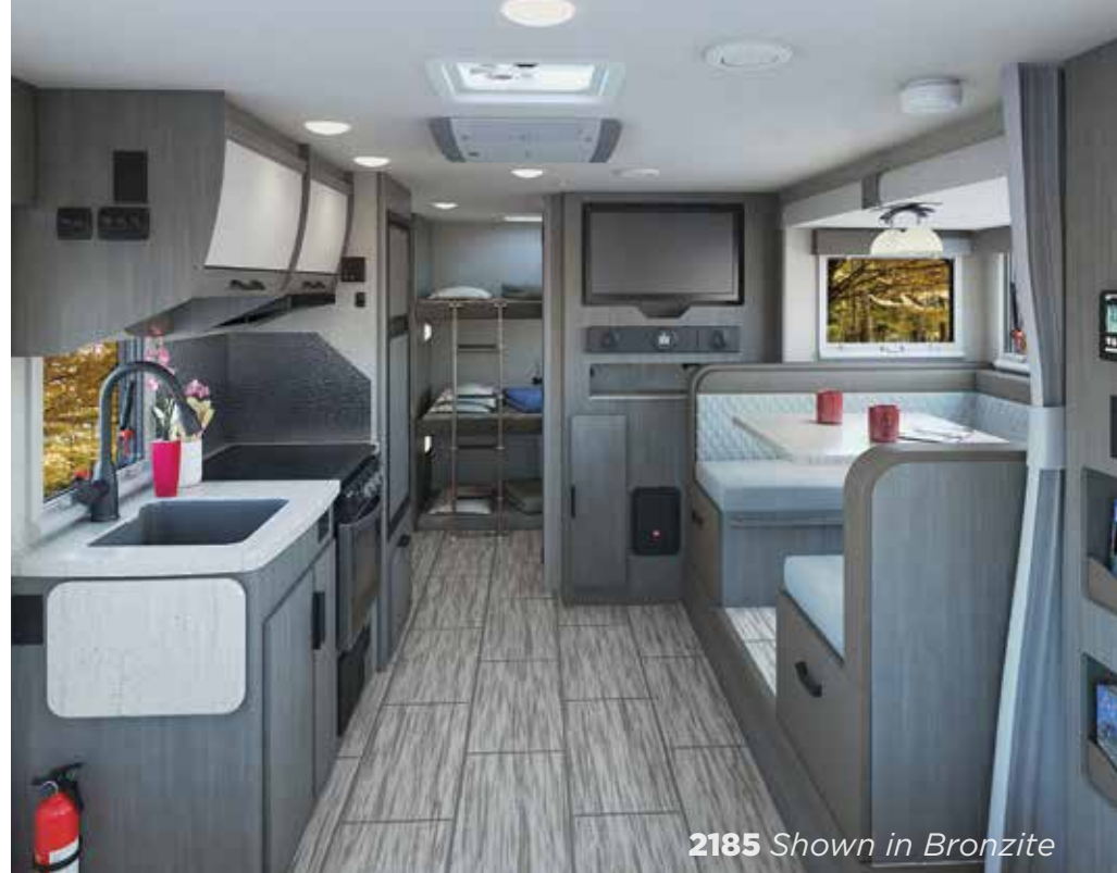
2185 Shown in Bronzite