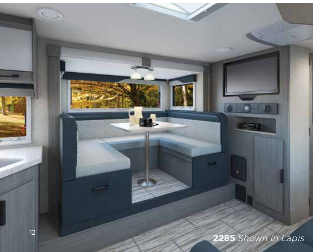
2285 Shown in Lapis