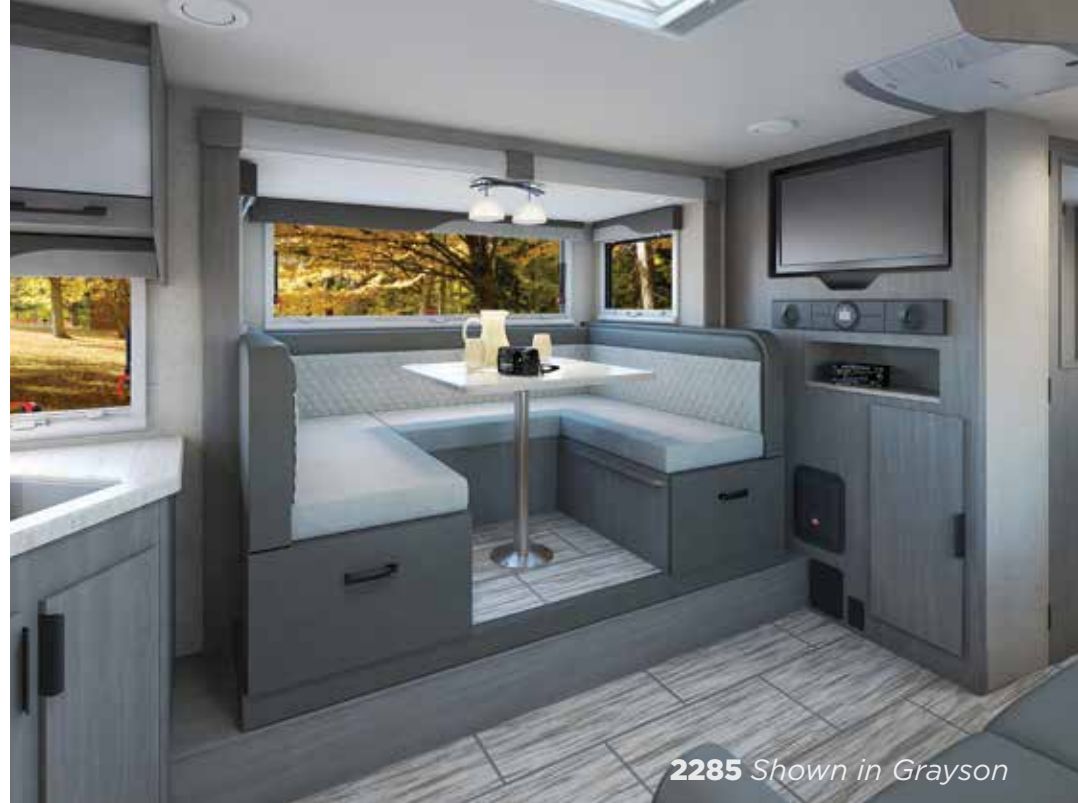
2285 Shown in Grayson