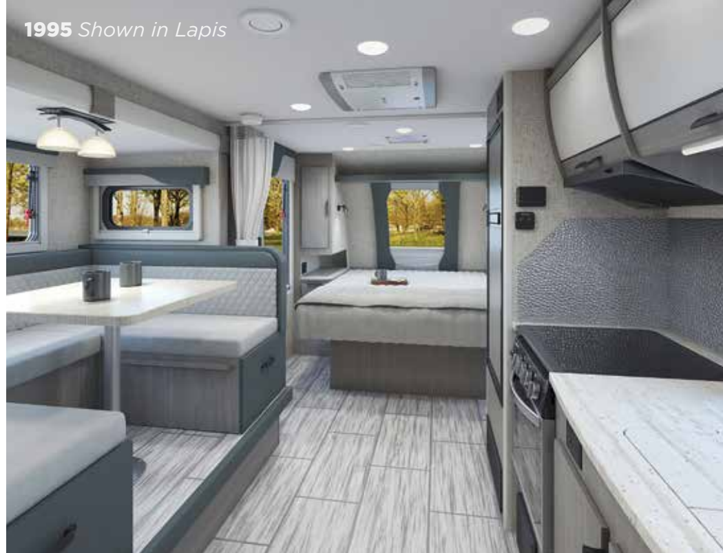
1995 Shown in Lapis