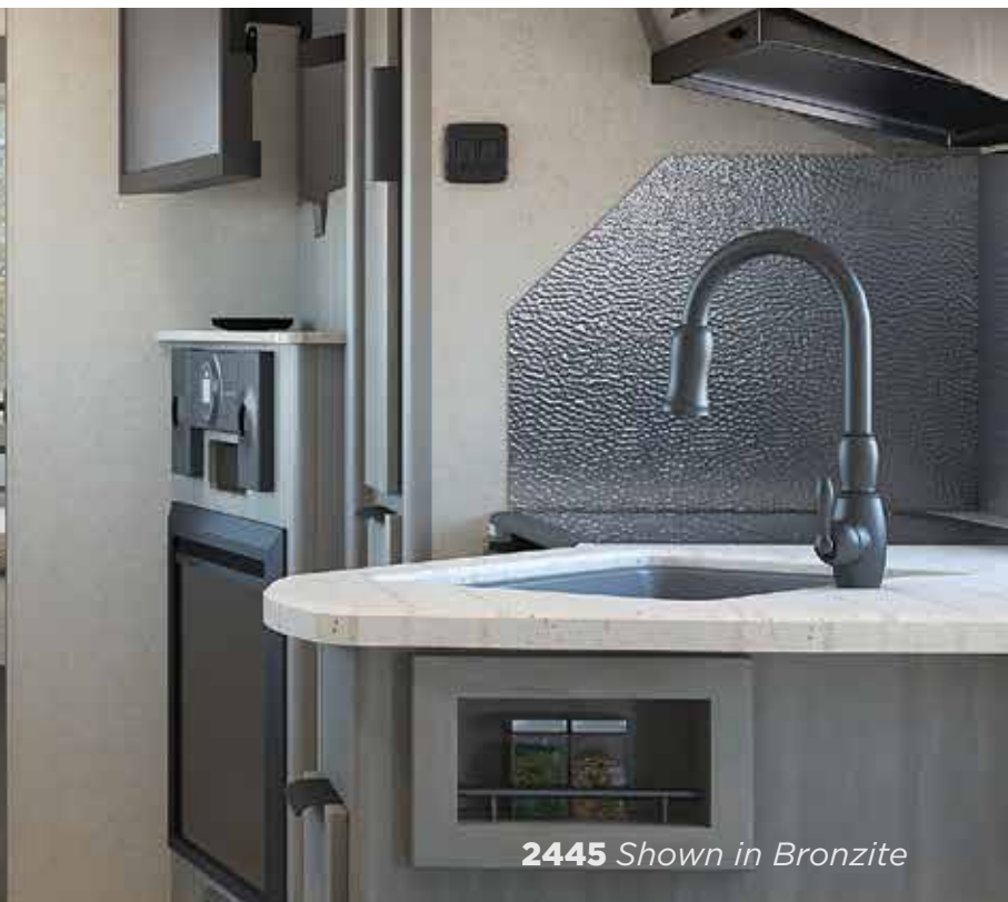
2445 Shown in Bronzite