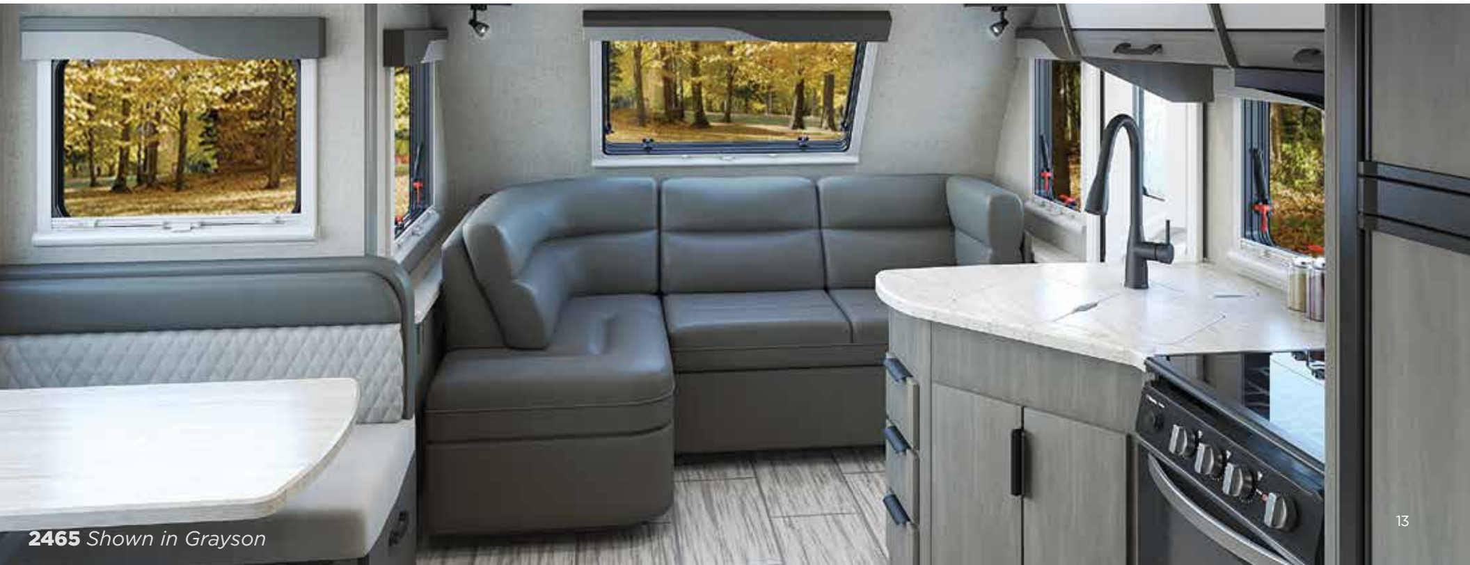
2465 Shown in Grayson