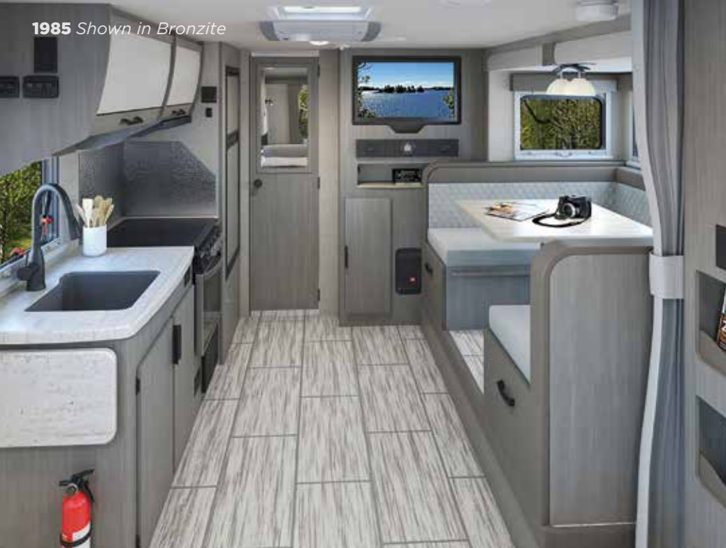
1985 Shown in Bronzite