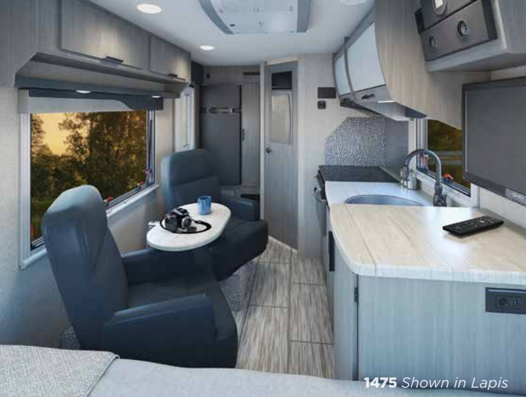
1475 Shown in Lapis