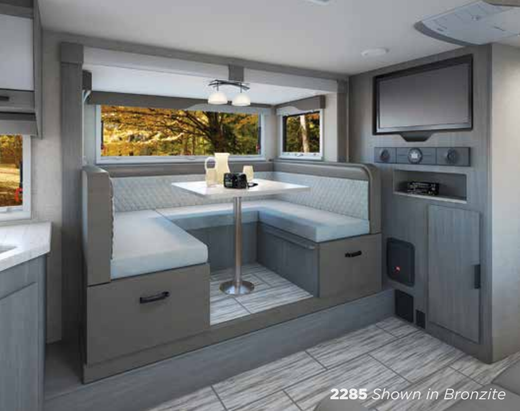
2285 Shown in Bronzite