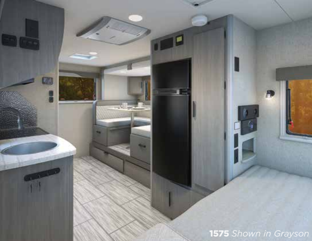
1575 Shown in Grayson