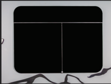
Automotive Frameless Windows Package

The Wolf Pup is proud to offer the Black Label Edition as an optional upgrade to the brand. The Black Label Edition includes all the regular standard Wolf Pup features along these additional highlights shown below.