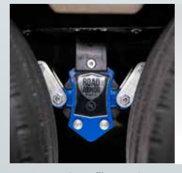
EXCLUSIVE Road Armor™ suspension Equalizes axle load to dampen shock and vibration