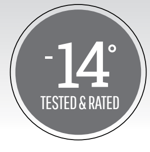
Cold weather rated and tested Camp to -14°F without water lines or tanks freezing