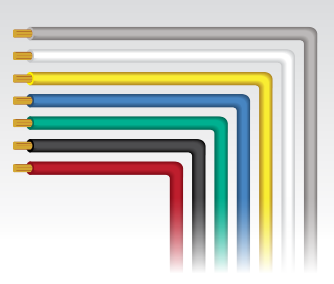
EXCLUSIVE color-coded Unified Wiring Standard

Easy-to-trace circuits simplifies and expedites electrical and entertainment system troubleshooting