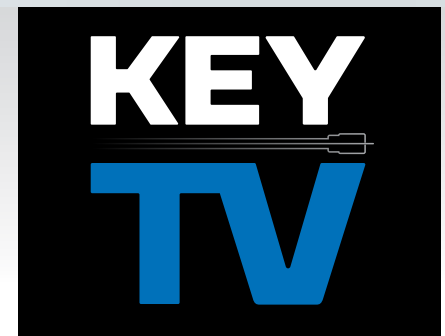
Game-changing single-point control of over-the-air, cable and satellite feeds