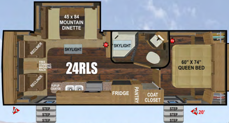
DRY WEIGHT: 6650 ~ FLOOR LENGTH: 24'