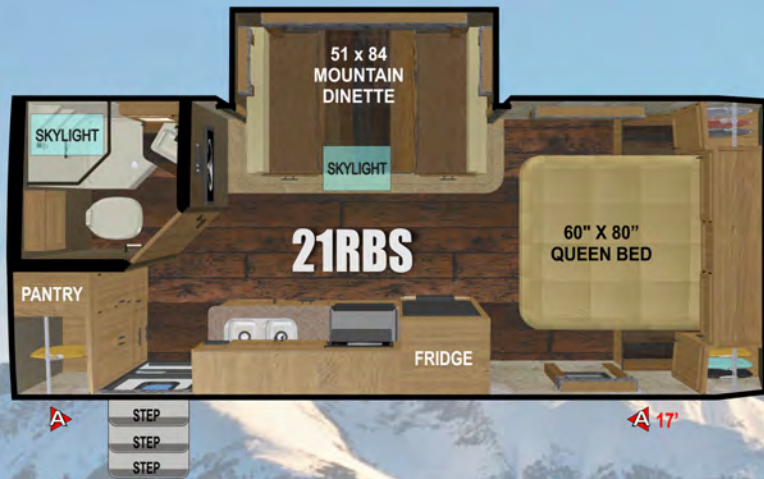
DRY WEIGHT: 5395 ~ FLOOR LENGTH: 20'