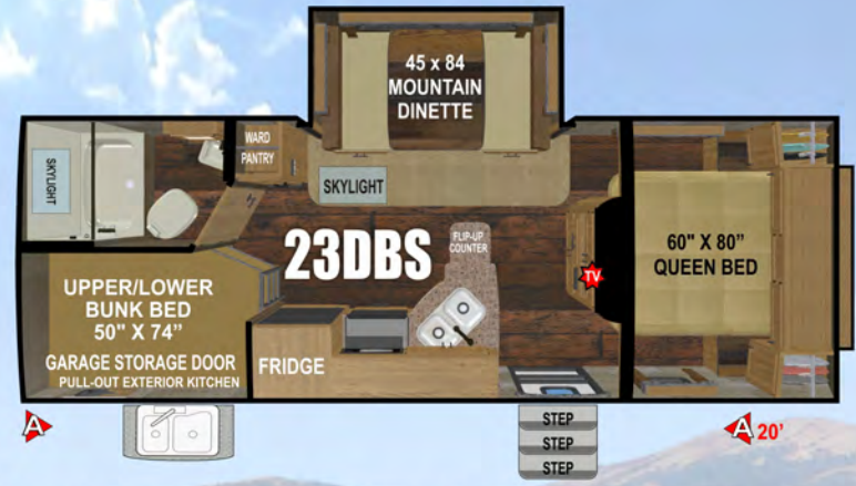
DRY WEIGHT: 6350 ~ FLOOR LENGTH: 23'