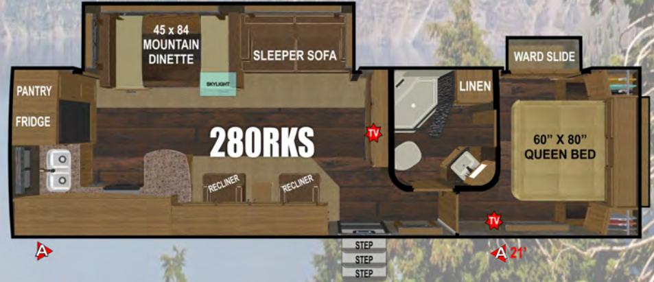
DRY WEIGHT: 8050 ~ FLOOR LENGTH: 29'