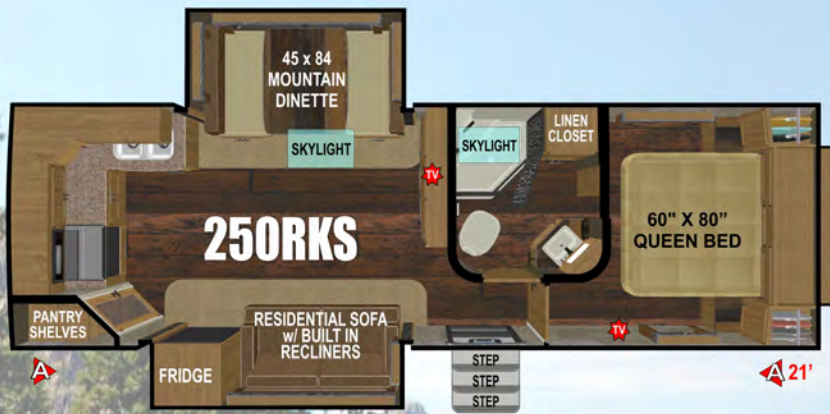
DRY WEIGHT: 7375 ~ FLOOR LENGTH: 26'