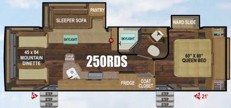
DRY WEIGHT: 7295 ~ FLOOR LENGTH: 27'