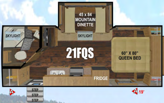
DRY WEIGHT: 6000 ~ FLOOR LENGTH: 21'