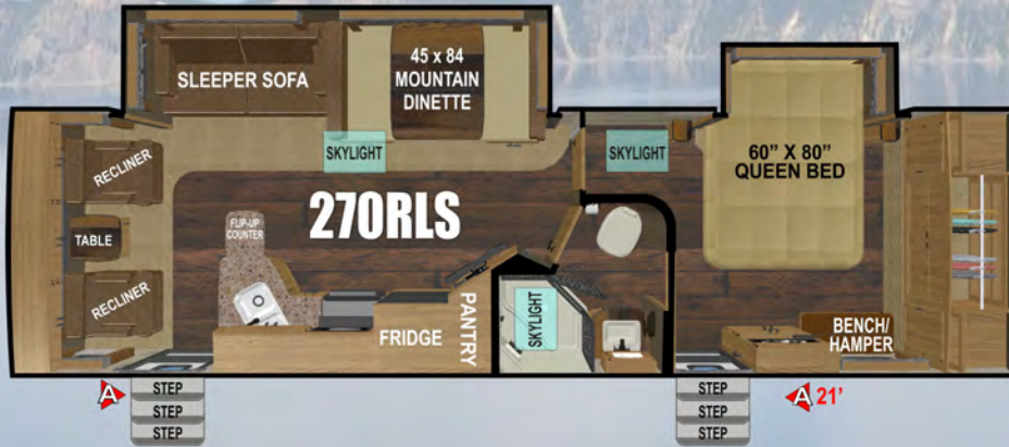
DRY WEIGHT: TBD ~ FLOOR LENGTH: 30'