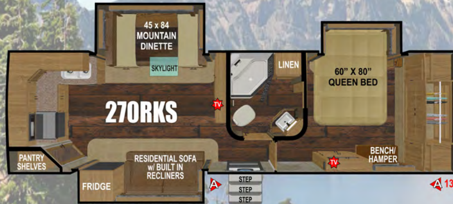
DRY WEIGHT: 8100 ~ FLOOR LENGTH: 29'