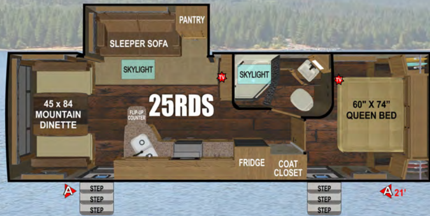
DRY WEIGHT: 7080 ~ FLOOR LENGTH: 26'

MOST MODELS AVAILABLE IN BOTH MOUNTAIN AND TITANIUM SERIES