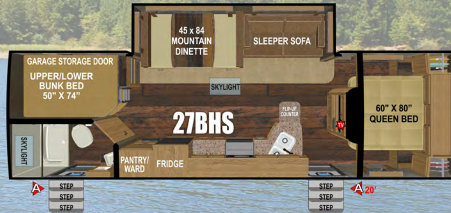
DRY WEIGHT: 7425 ~ FLOOR LENGTH: 28'

TV Indicates locations for living room 12v TV's and bedroom TV prep