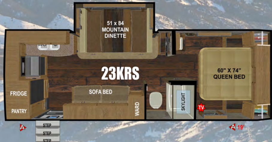
DRY WEIGHT: 5995 ~ FLOOR LENGTH: 23'