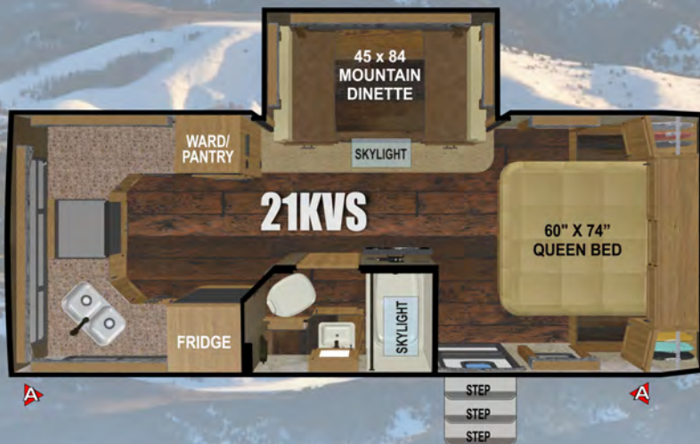
DRY WEIGHT: TBD ~ FLOOR LENGTH: 21'