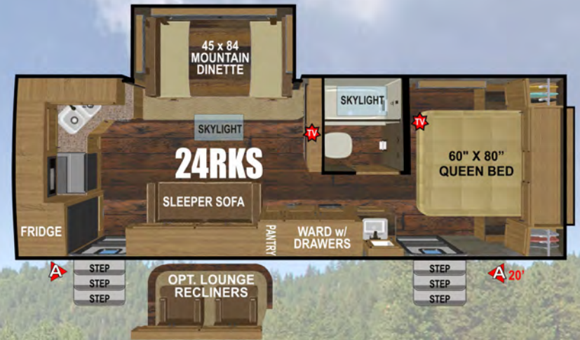
DRY WEIGHT: 6600 ~ FLOOR LENGTH: 24'