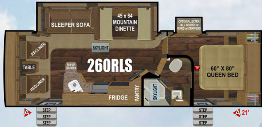
DRY WEIGHT: 7395 ~ FLOOR LENGTH: 27'