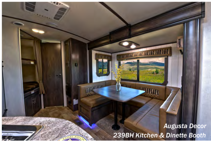
Augusta Decor 239BH Kitchen & Dinette Booth