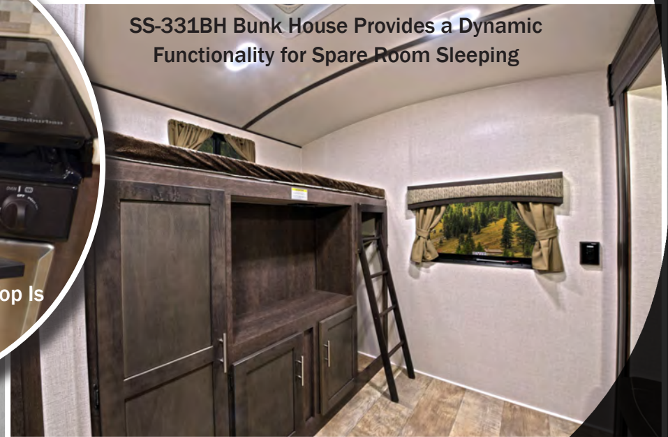
SS-331BH Bunk House Provides a Dynamic Functionality for Spare Room Sleeping