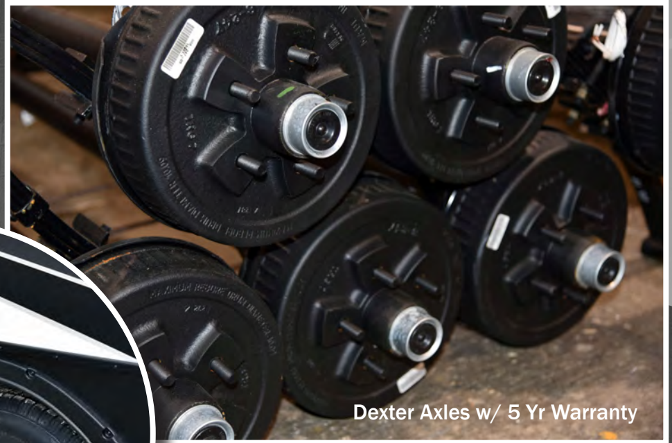
Dexter Axles w/ 5 Yr Warranty