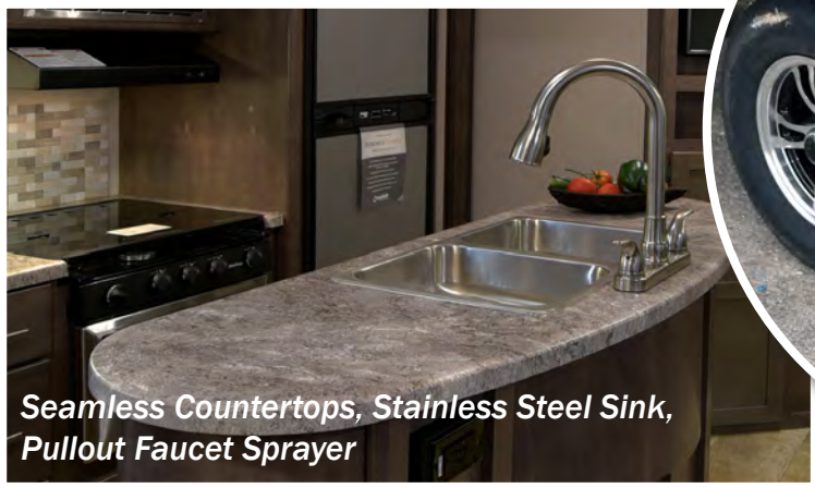
Seamless Countertops, Stainless Steel Sink, Pullout Faucet Sprayer