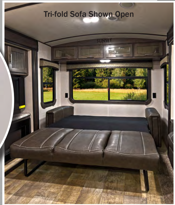
Tri-fold Sofa Shown Open