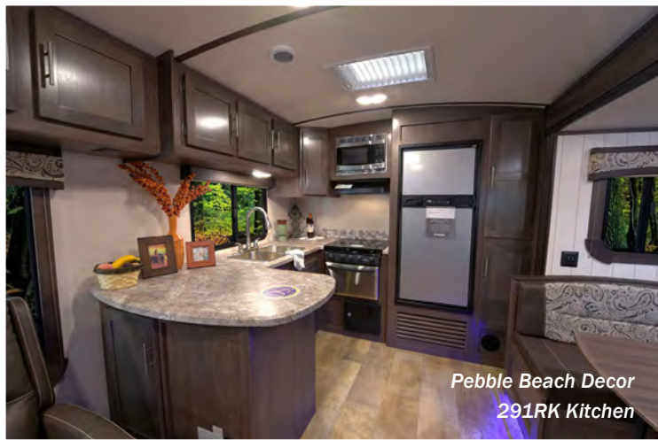
Pebble Beach Decor 291RK Kitchen