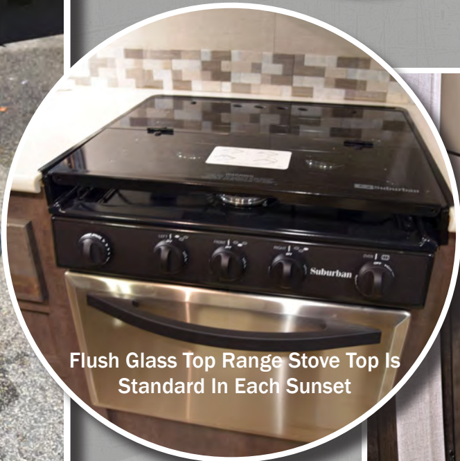
Flush Glass Top Range Stove Top Is Standard In Each Sunset