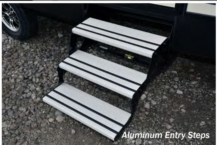
Aluminum Entry Steps