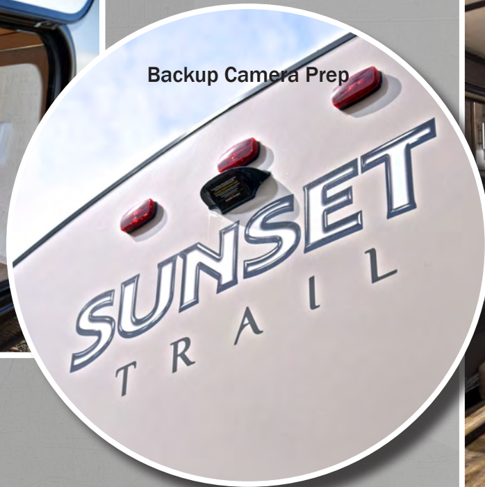
Backup Camera Prep