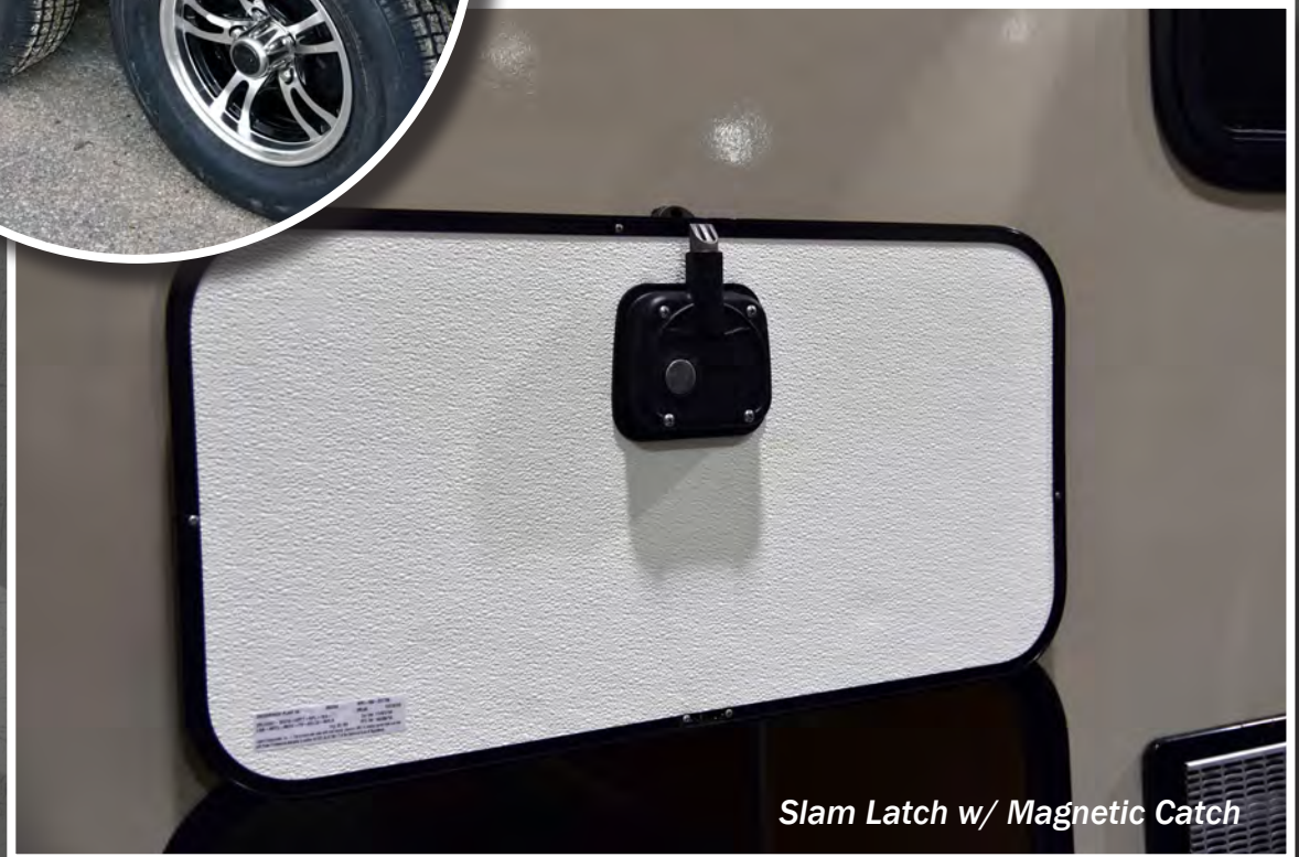
Slam Latch w/ Magnetic Catch