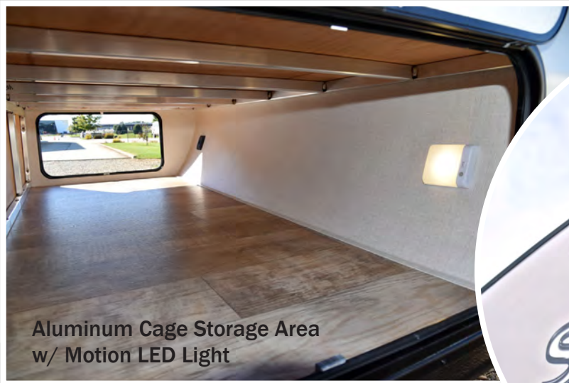
Aluminum Cage Storage Area w/ Motion LED Light