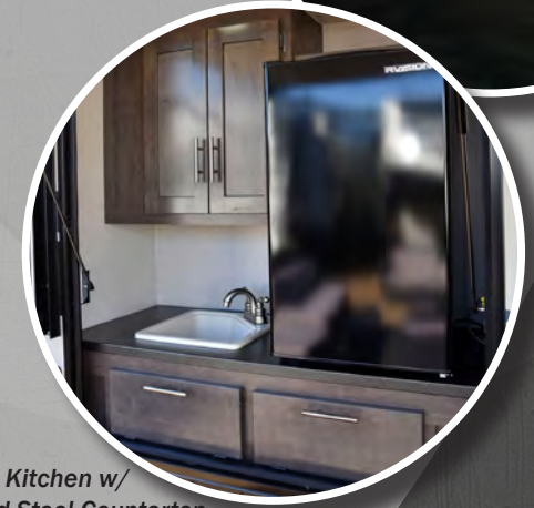
Outdoor Kitchen w/ Stamped Steel Countertop