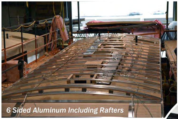
6 Sided Aluminum Including Rafters