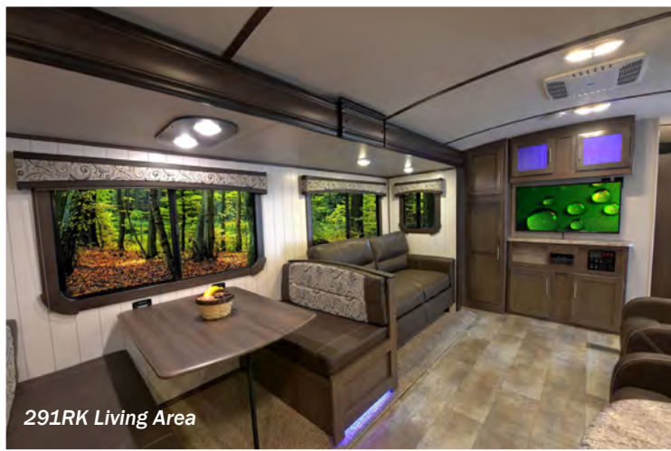
291RK Living Area