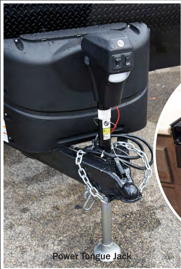
Power Tongue Jack