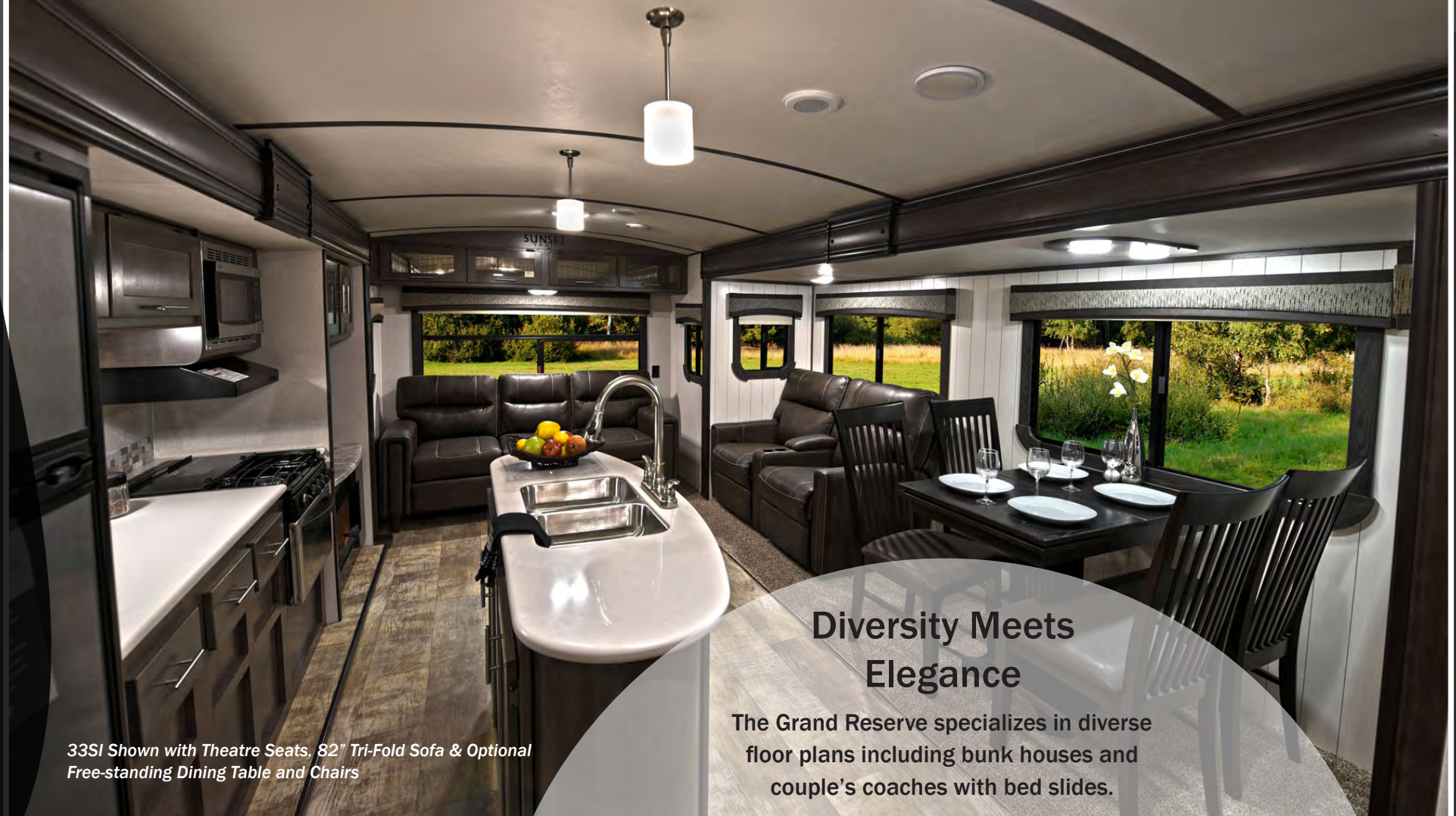
33SI Shown with Theatre Seats, 82" Tri-Fold Sofa & Optional Free-standing Dining Table and Chairs