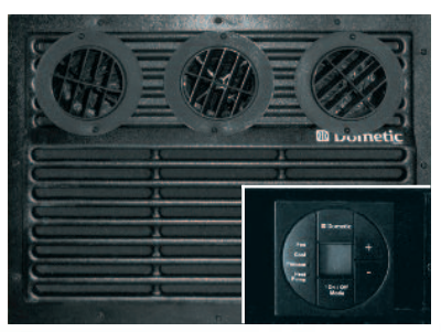
The Dometic Cool Cat 10,150 BTU heat pump is standard on Clipper hardside camping trailers.

The Create a Breeze fan circulates five times more air than a conventional 12 volt fan.