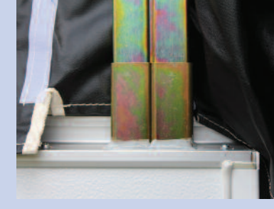
The Goshen Stamping double-wide lift arm system offers strength, stability and increased wind resistance. (Limited lifetime warranty)