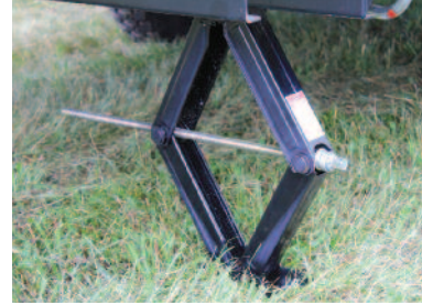
The four heavy duty scissor-style stabilizing jacks extend and retract easily using a cordless drill and the Canimex drill bit.