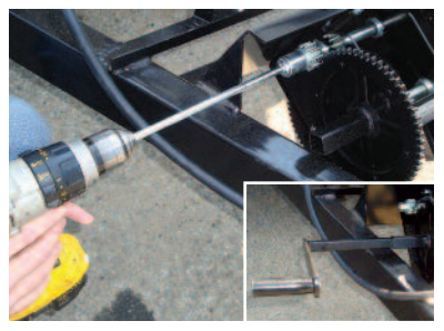
The easy-to-use Canimex dual drive/dual purpose winch and drill bit, combined with a cordless drill, raises and lowers the roof in under 30 seconds. A manual override is provided.

Clipper's innovative, user-friendly system increases leisure time. Set up in five minutes and let the good times roll!