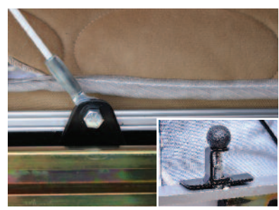
This exclusive "Glide-N-Lock" cable supported bed system eliminates the need for support poles under the beds. Simply pull out the beds until they lock into place and install the tension rafter.