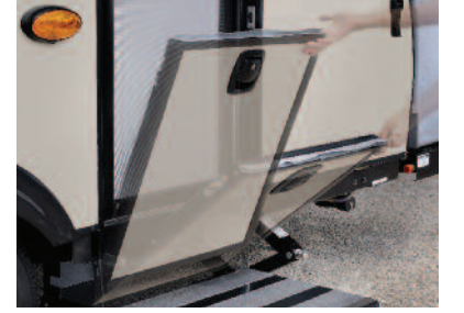
The E-Z Swing Stepper Door with hydraulic assist, operates in seconds and provides the largest, most stable step platform in the industry.