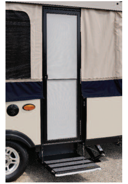
Clipper's one piece entry door has an extra large adjustable privacy panel to let in fresh air and sunlight. (N/A 806LS)