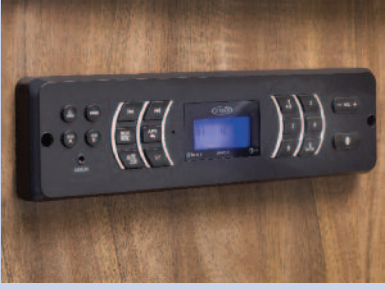
Jensen AM/FM/Bluetooth stereo with App control includes Interior/Exterior speakers (Standard on Classic, V-Trec and Hardside models)