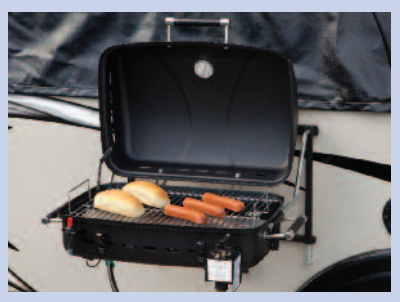
Exterior grill (N/A on LS series)