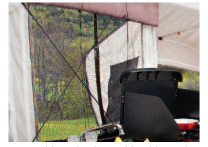
X-Cable technology adds additional stability to the roof and prevents over cranking of the roof.