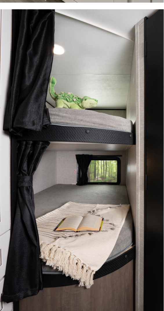
2025 Open Range Conventional 28BHS TT