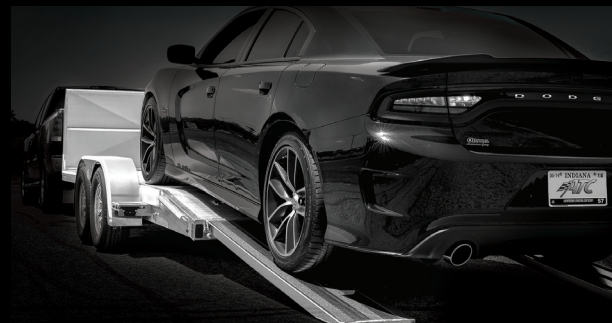
Transition smoothly onto ramp without scraping the car's underside.