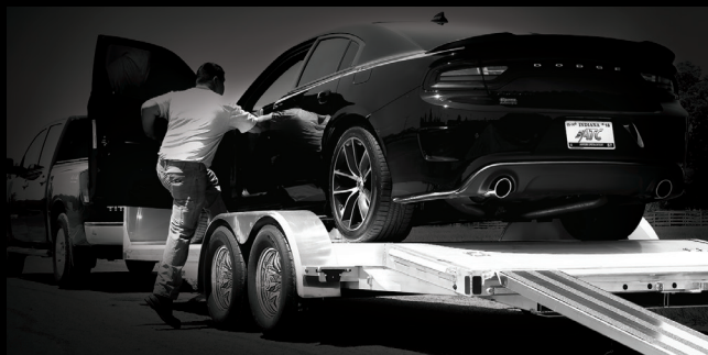
Door opens above the fenders.