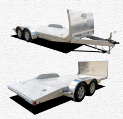
OPEN CAR HAULER