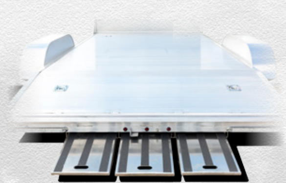
optional third ramp pictured