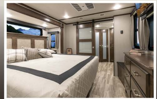
Sleep well in the spacious master suite with plenty of storage space, with the ability to choose either a king or queen size bed. (372WB/373FB shown)