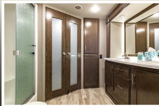
The bath area has modern appeal with a large undermount sink, designer faucet, and generously sized shower with seat. (372WB/373FB shown)