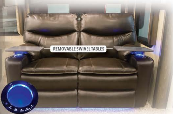
REMOVABLE SWIVEL TABLES

The most spacious EXTENDED STAY FIFTH WHEEL EVER BUILT!