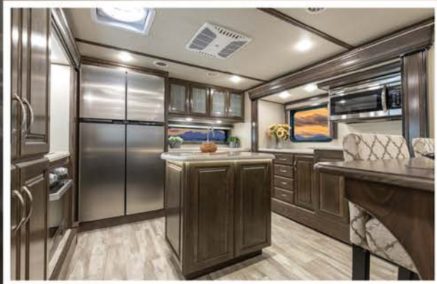
A luxurious kitchen with solid surface countertops, chef-inspired stainless steel appliances, residential fixtures, and hardwood cabinetry. (390RK shown)