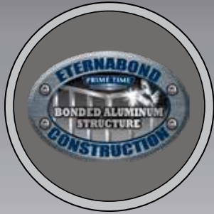
EXCLUSIVE ETERNABOND® CONSTRUCTION