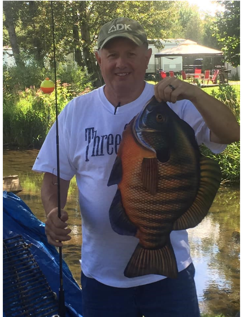
One of Eddie's latest: