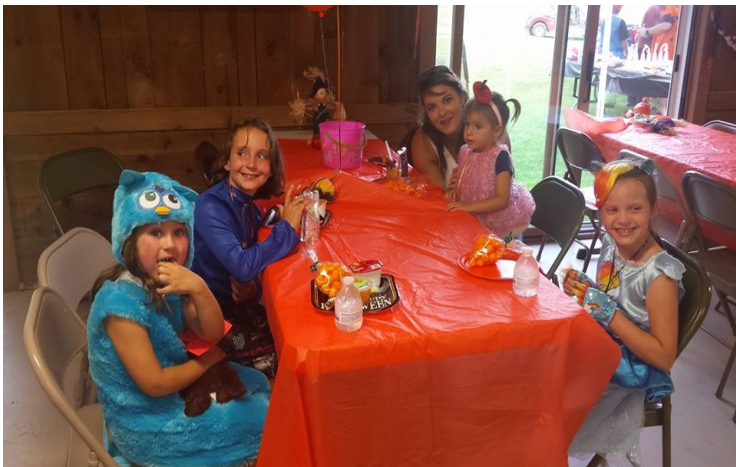
Our ghouls and goblins enjoying the Halloween Party!