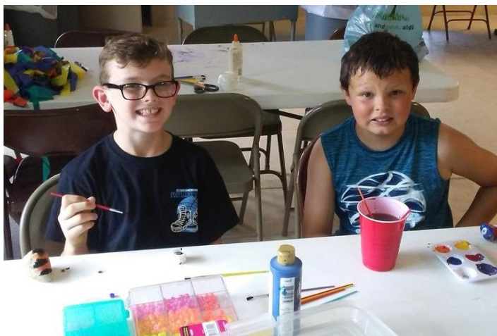
Having a blast making crafts!