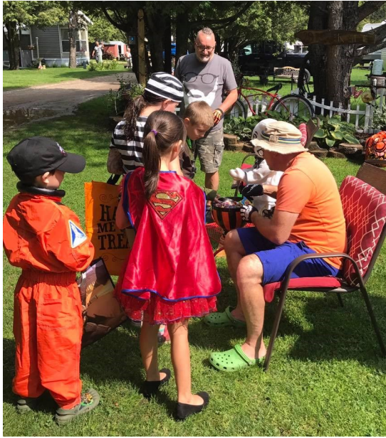
The Trick or Treating was a hit!