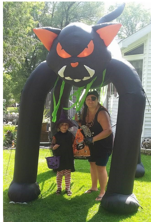
Our campers enjoyed all of the

the Banquet right after on Sunday. Note: Parents, please bring your cameras and cell phones if you want pictures.