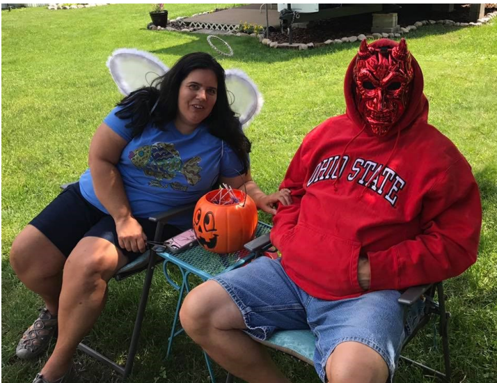
The adults has just as much fun at Trick or Treating as the kids!

50/50: Our lucky winner was Oliva Hale from Spring 10 with the winning number 4317015. The pot was $501.50.