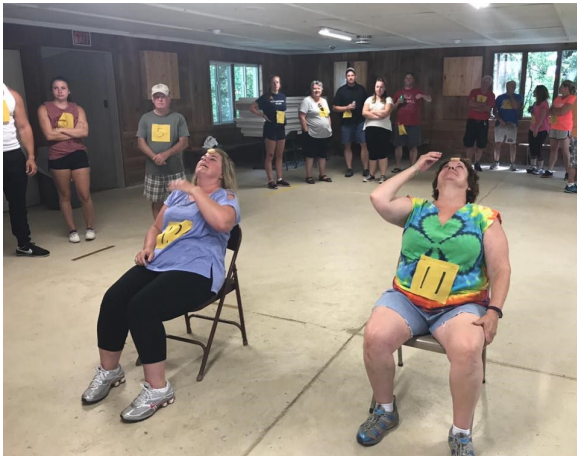
Having fun at the Adult Field Day!