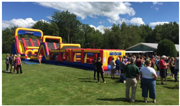
It was the adults' turn to have some fun at the Adult Field Day!

Last weekend didn't turn out so bad, we had some rain but then it got nice and warmed up. This weekend's weather says we might get a few showers but not a complete wash out.