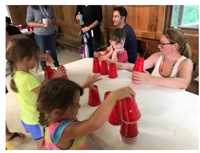
The Kid's Field Day a few weeks ago was a success!