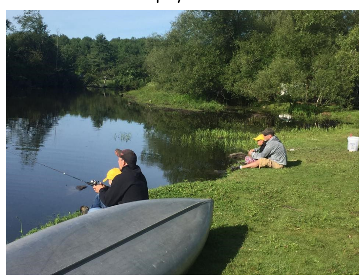
A great time was had at the Fishing Derby!

1:00-3:00 pm: Kid's Halloween Party Please sign up at the office. It is very important that you sign up for this event so