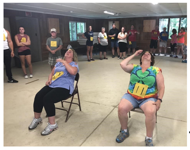
Some of the Field Day challenges proved to be pretty difficult!

the cart will have to leave the campground and not return. If you are not sure of your number or have not gotten one yet, come to the office to see Theresa.