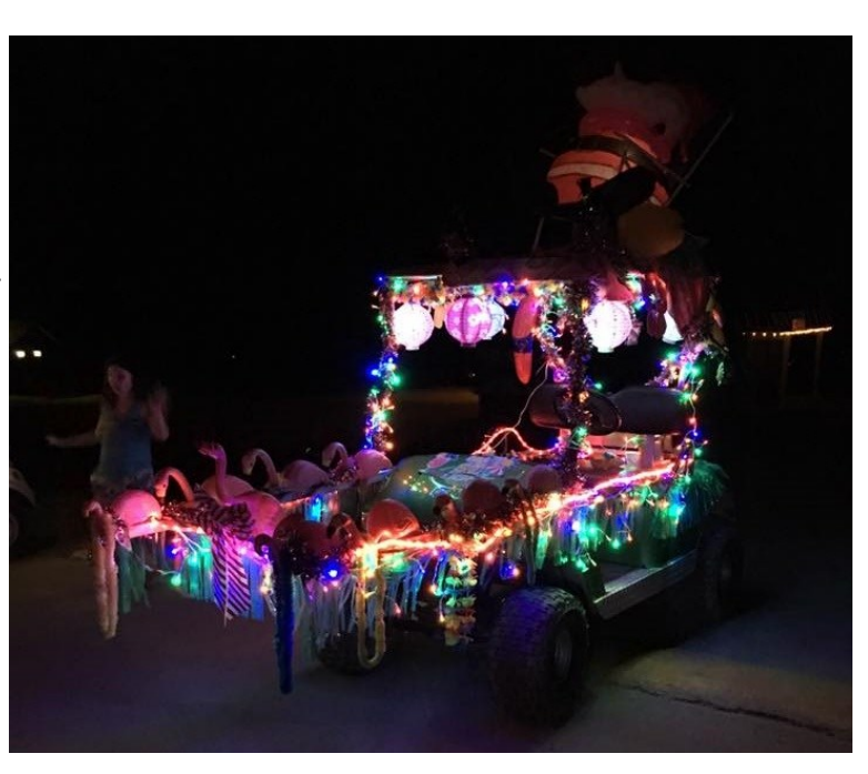
One of our beautiful floats from our Golf Cart Parade!

• Crafts: Not many kids again this week, but we made some new friends.