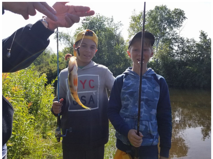
One fish caught by two fishermen at the Fishing Derby!