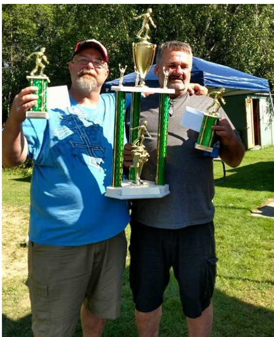
Some of our winners from the Horseshoe Tournament!