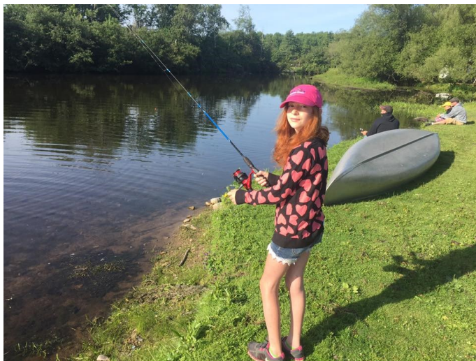
We had a beautiful day for our fishing derby!

We had yet another wonderful weekend. Our summer has arrived! This weekend's weather is showing that we might get a few thunder showers, but no major storms. We will take all the sun and warmth Mother Nature wants to give us!