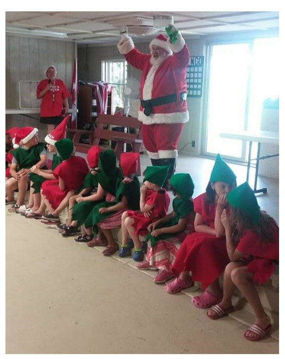
All of the little elves were excited to see Santa!