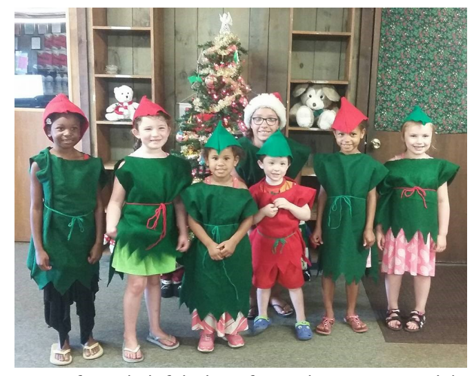
Some of our helpful elves from Christmas in July!

The weather was wonderful all weekend! Everyone had a great time with Santa and his elves. The outlook for this coming weekend looks good as well, so let's enjoy more sun and warm weather!