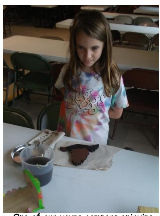
One of our young campers enjoying Crafts with Flo!

and of course popcorn and lemonade. Stay tuned for the location and time. If the weather is on our side we will hold it outdoors. We will put it on the office board where it will be held.