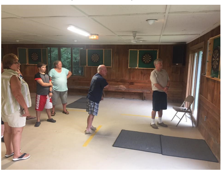
Some stiff competition at Darts!

If you would like us to put something in the Gazette it needs to be submitted to us by no later than 12:00 pm on Tuesday.