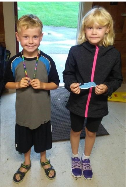
Some young campers showing off their creations!