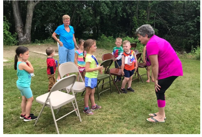
A great time was had by everyone at the Kid's Field Day!

• 7:00 pm: Adult Bingo - You might be a big winner! Children may attend, but must be with an adult and must purchase a $5.00 entry pack - no exceptions!