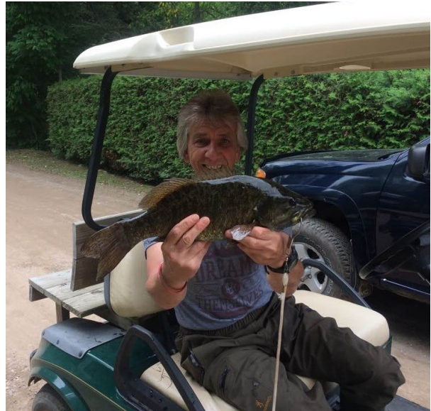
A great catch by one of our campers.